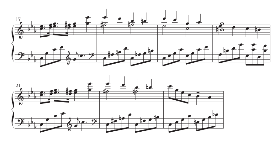
EXAMPLE 12. "The Man I Love" sketch – B section. mm. 17–23, as it appears on the manuscript. March–April notebook, pp. 16–17

song is written out as a solo piano piece, not in the single-line lead sheet format so common to the tune books of this period. Second, although the A section features block chords in the accompaniment that one might expect in a lead sheet, the sighing obbligato Gershwin adds to the second A is written an octave higher in the sketch than in the sheet music or the solo piano version, suggesting he might have originally intended it as one of his characteristic left-hand crossover devices. That the block chords are an integral part of the overall conception of the piece is borne out by both the sheet music, where they are transferred directly without alteration (ex. 13a), and by the later solo piano version. In the solo version, Gershwin keeps the block chord construction but gives it a grandiose expansion. The chords are extended into two-handed voicings, which alternate in a call-and-response fashion with the melodic line, also realized in two-handed block chords (ex. 13b). 47 The overall effect of the solo piano version does not suggest a pop tune, but a more serious, light classical work.48