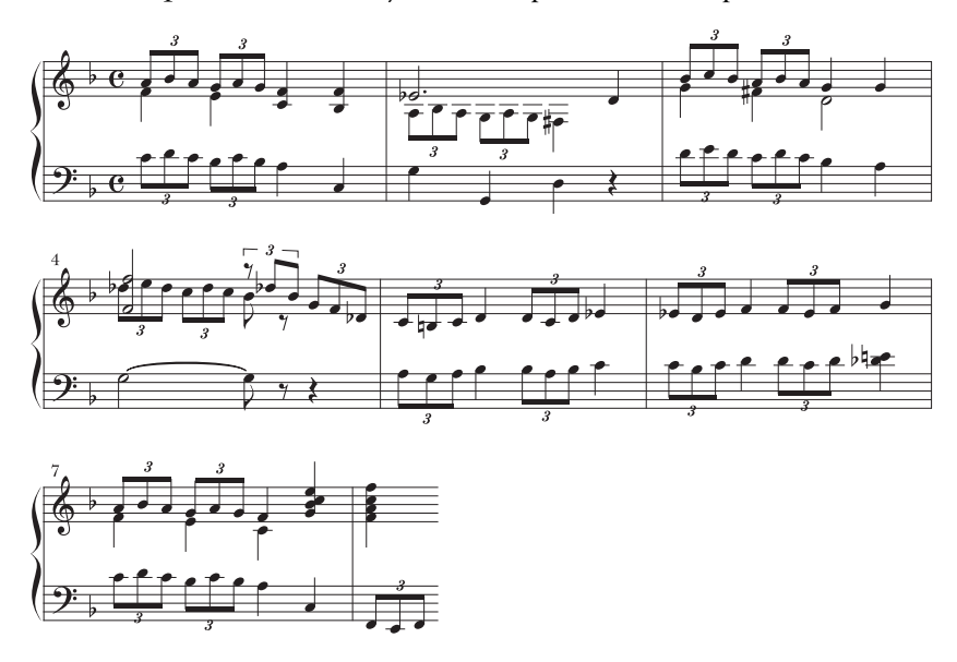
EXAMPLE 4b. "When Toby Is Out of Town" - Refrain

EXAMPLE 4a. Undated entry, March-April notebook, p. 8.