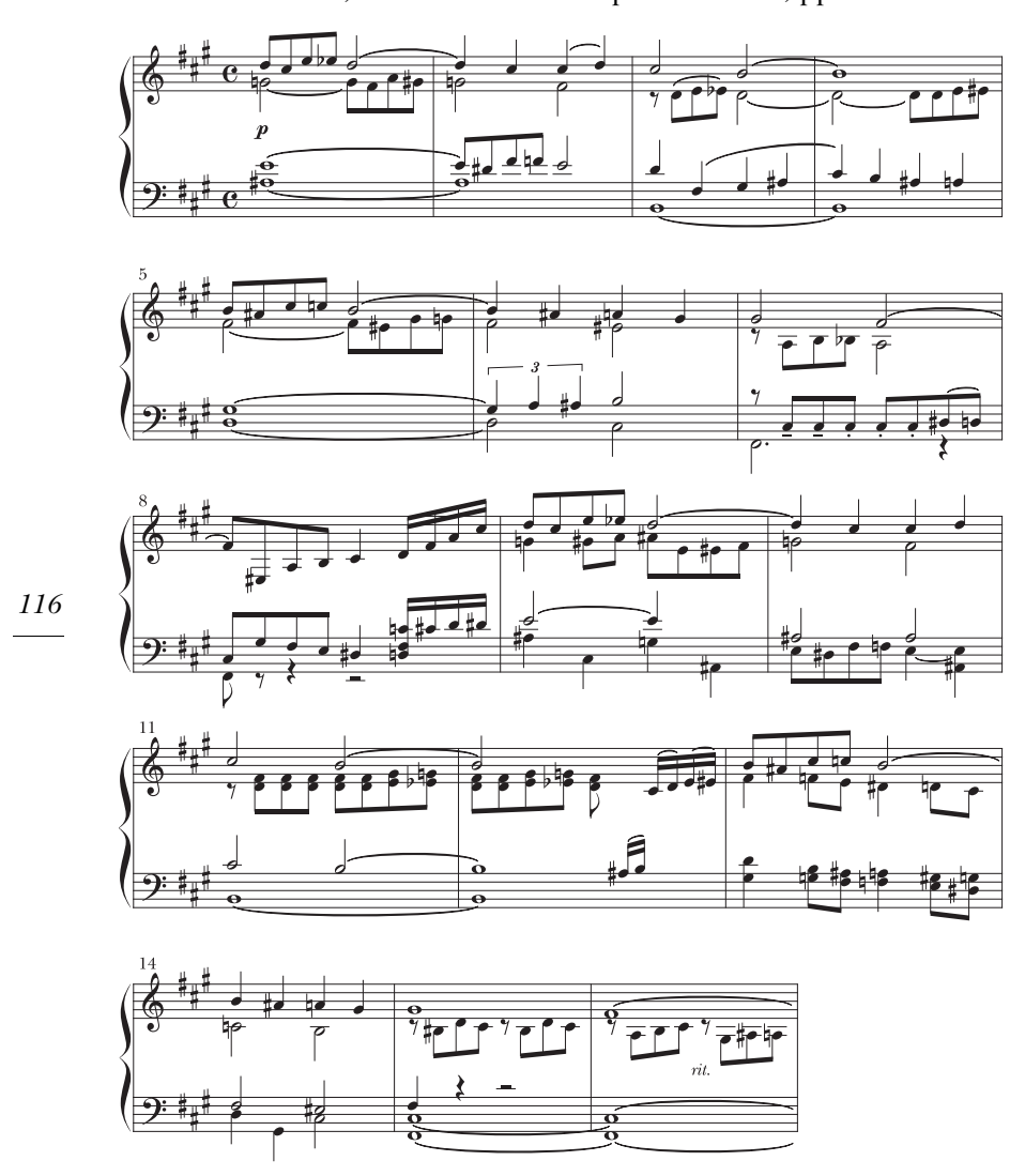
EXAMPLE 8. Short piece written on the B-A-C-H motive dated 24 April 1924, mm. 1–16. March–April notebook, pp. 18–19

a whole step and repeated sequentially in measures 10–11, is one of the few in the notebook that would serve well as either the B phrase of a Gershwin pop tune or in an instrumental work. Another interesting harmonic feature in this little piece is found in the final measure of the B section (ex. 9c). Here, the arpeggiated figure introduced earlier in the