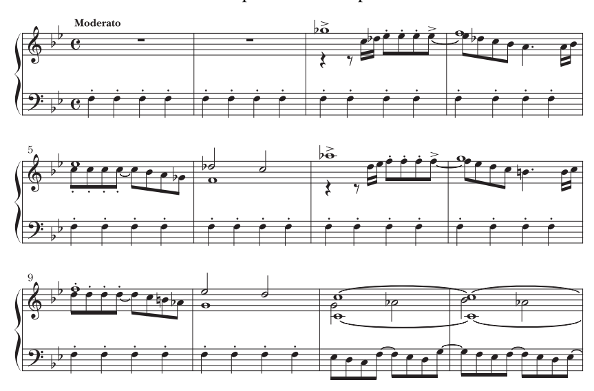
EXAMPLE 3. Opening measures of the "oriental" piece dated 5 March 1924, March–April notebook p. 7, mm. 1–12

to fill and suggested appropriate accompanying actions for the duration of the number." The 1924 Scandals was the fifth George White show for which Gershwin wrote most, if not all, of the music.