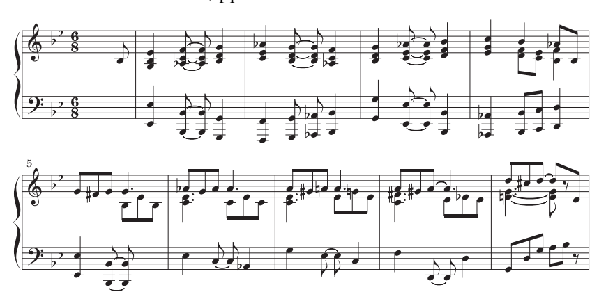
EXAMPLE 10. "B" section of "Moderato," mm. 6–16, from March–April notebook, pp. 6–7

4. Asymmetrical form schemes. By the mid-1920s Gershwin, like all popular songwriters, was well accustomed to writing in standard Tin Pan Alley song forms. The most common of these was the standard sixteenor thirty-two measure AABA or AABC form, where each phrase was either four or eight measures long. Starr observed that Gershwin often seems to have deliberately avoided this form and its implied symmetry in his concert music. For example, the first ninety measures of the Rhapsody in Blue feature phrases more typically five, seven, or some other odd number of measures in length. 42 A similar avoidance of Tin Pan Alley-related phrase symmetry is also evident in some of Gershwin's short piano works. For example, the B section of Prelude I (mm. 32-41) is disproportionately short compared with the A sections, giving way to the return of A after only ten measures. This is also true of the Impromptu in Two Keys (1929): the B section is only seven measures long, which is less than half the length of the first A section. As is sometimes found in piano preludes from Chopin onward, some of the shortest works do not include a contrasting B section at all. Melody No. 17, for example, is more strophic in nature, but Gershwin adds one or two measures in an allegretto tempo for contrast rather than inserting a fully developed B section. In contrast, Rialto Ripples, Novelette in Fourths, and Prelude II are uncommon when