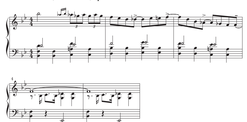
EXAMPLE 1. Southern Soil fragment from Gershwin's Themes notebook (1924–1925), p. 2

work covers two-and-a half octaves—f to b_b^2 —a range challenging to all but the best-trained operatic mezzo-sopranos. <sup>10</sup>