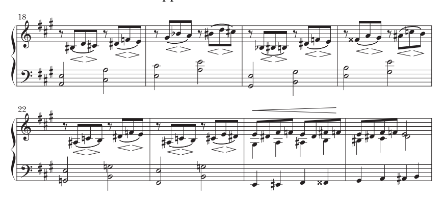
EXAMPLE 11. Piece on B-A-C-H, "B" section, mm. 18–25, March–April notebook, pp. 18–19

formal issues in the shorter piano works are considered. Because these three pieces are either fully developed rags or related to ragtime via the blues songs of W. C. Handy, they are constructed with fully realized discrete sections—a feature not always present in Gershwin's other published short works for piano. 43