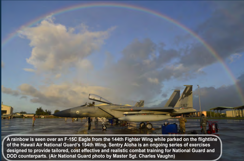
A rainbow is seen over an F-15C Eagle from the 144th Fighter Wing while parked on the flightline of the Hawaii Air National Guard's 154th Wing. Sentry Aloha is an ongoing series of exercises designed to provide tailored, cost effective and realistic combat training for National Guard and DOD counterparts.

The 144th Fighter Wing's F-15's are participating in the exercise along with KC-135 Stratotanker air refueling support from the Wisconsin Air National Guard, F-16 Fighting Falcons from Alaska and radar aircraft from Oklahoma. The visiting aircraft will take part in simulated combat exercises with the 199th and 19th Fighter Squadrons' Hickam based "Hawaiian Raptors."