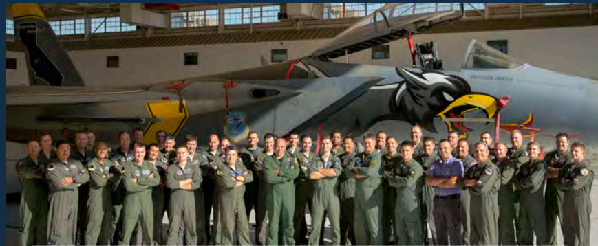
Members of the 144th Operations Group stand with Ukrainian pilots in the 144th Maintenance Hangar Sept. 8, 2019. The visit is part of the State Partnership Program between Ukraine and the California Air National Guard.