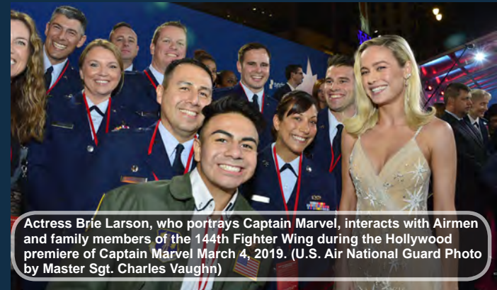
Actress Brie Larson, who portrays Captain Marvel, interacts with Airmen and family members of the 144th Fighter Wing during the Hollywood premiere of Captain Marvel March 4, 2019.

2019 was a busy year with a high operations tempo. While the mission must always get done, Wing leadership has placed a renewed emphasis on taking care of our people. Our people, after all, are the ones who make the mission happen.