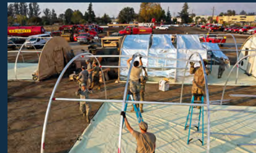
During the Kincade Fire in early October, Airmen from the 144th Civil Engineering Squadron quickly deployed to set up camp for over 300 Guardsmen, securing a base of operations for fire response efforts.