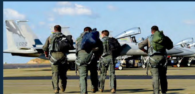
Pilots assigned to the 194th Expeditionary Fighter Squadron, California Air National Guard, step to their F-15C Eagles during Exercise Diamond Storm at Royal Australian Air Force Base Darwin, Northern Territory, May 13, 2019.