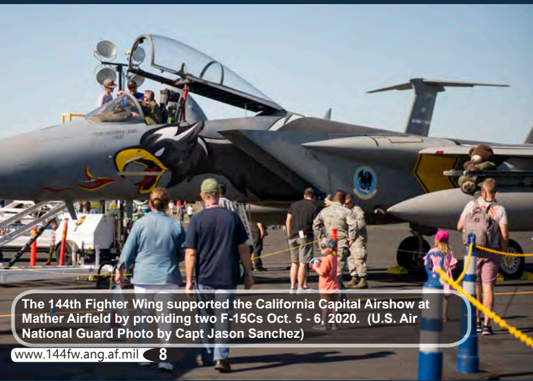
The 144th Fighter Wing supported the California Capital Airshow at Mather Airfield by providing two F-15Cs Oct. 5 - 6, 2020.