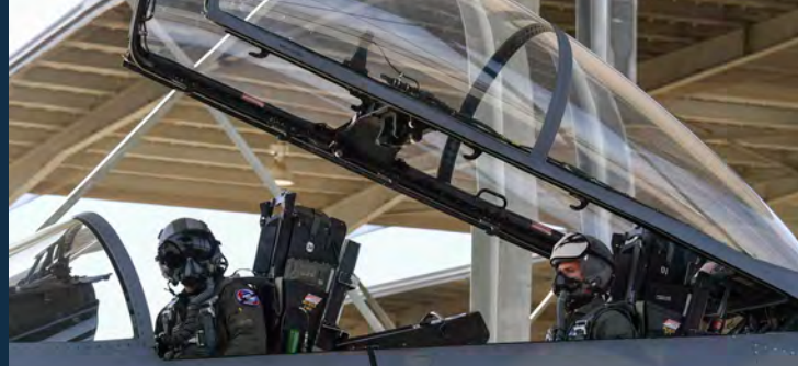
194th Fighter Squadron pilots flew Ukrainian pilots on familiarization flights Sept. 6 - 8, 2019.

As part of the State Partnership Program, the 144th FW hosted six Ukrainian pilots from Sept. 3 to Sept. 9, strengthening our interoperability with partner nations and our NATO allies. Each Ukrainian pilot was given