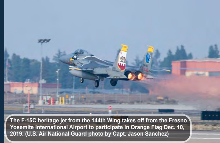
The F-15C heritage jet from the 144th Wing takes off from the Fresno Yosemite International Airport to participate in Orange Flag Dec. 10, 2019.