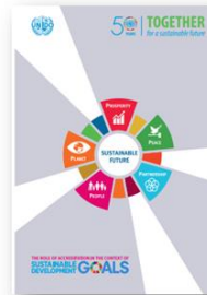
The Role of Accreditation in the context of Sustainable Development Goals (UNIDO, 2016)