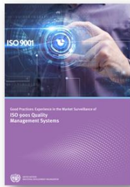
Good Practices: Experience in the Market Surveillance of ISO 9001 Quality Management Systems (UNIDO, 2017)

IAF continues to enhance engagement with relevant international organizations, with a number of joint publications being published with UNIDO and OECD during late 2016/early 2017, and a number of joint communications efforts being considered e.g. development of a Joint Communications Strategy with ILAC and ISO, and a joint Industry Day with ISO/CASCO and industry members during the 2018 Joint Annual meetings.