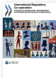
International Regulatory Co-operation: The Role of International Organisations in Fostering Better Rules of Globalisation (OECD, 2016)