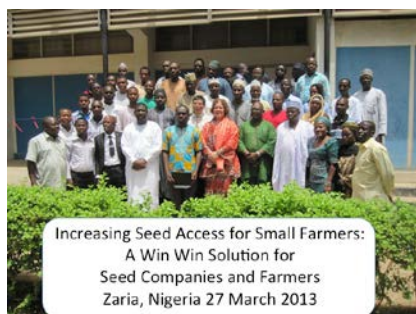
Nigerian Marketing Program