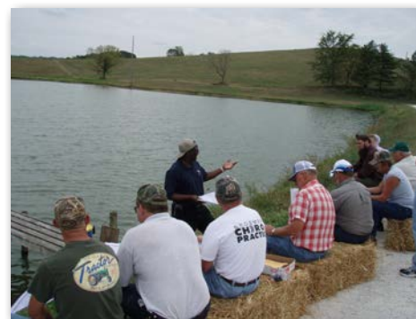
Aquaculture Extension Program