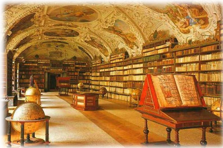
"Theology Hall," in a twelfth-century Strahov Monastery in Prague