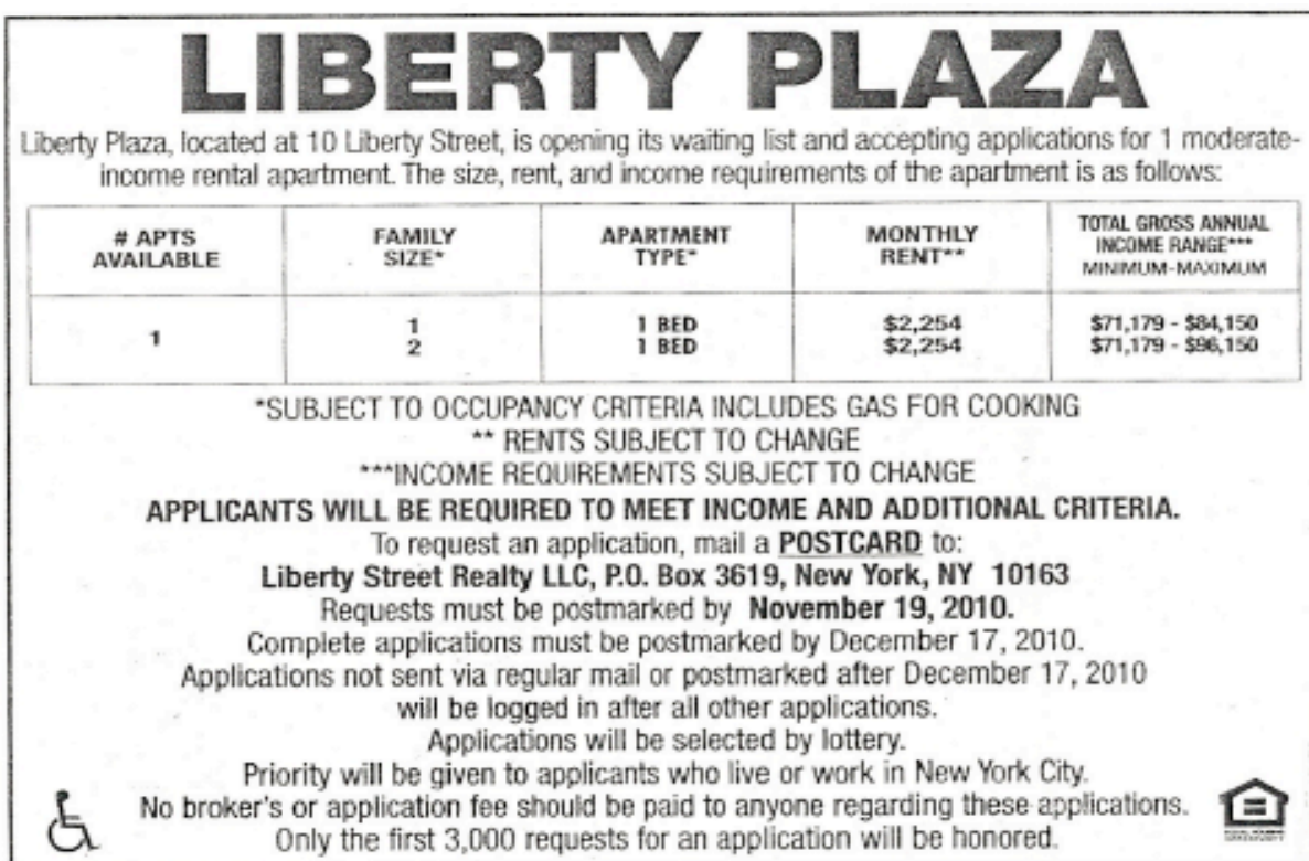
Figure 1. Affordable housing notice as it appeared in the Tribeca Trib