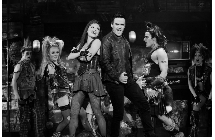
The cast of the national tour of We Will Rock You.