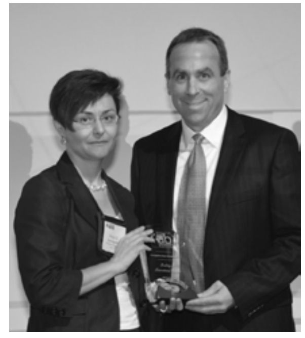
2013 AIB/Sheth Award for Best Doctoral Dissertation Proposal Sponsored by the Sheth Foundation

"Handling Pressures of Community Logic: The Impact of Clan Ties on Recruitment and Selection in Kazakhstan"