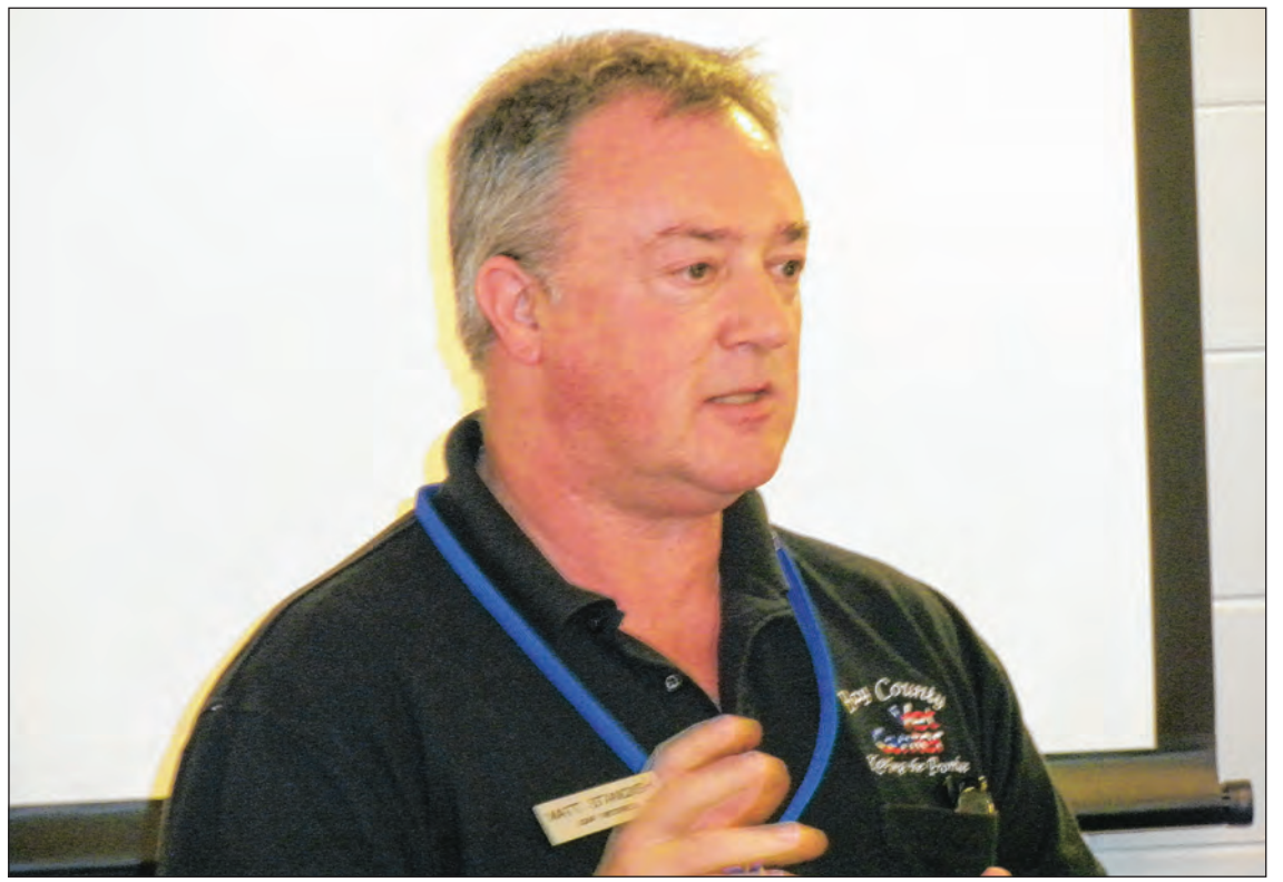
SPECIAL TO THE NEWS

Readjustment counseling is a wide range of psychological and social services offered to eligible Veterans and their families in the effort to make a successful transition form military to civilian life. They include: Individual and group counseling for Veterans and their families; Family