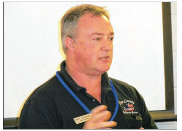
Kiwanis Club hears from Air Force veteran | A3