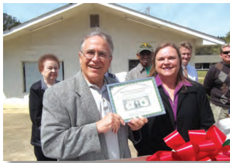
March 21 Honest Gold Guy of Chipley & Living to Win Corp. 2922 Hwy. 77, Chipley