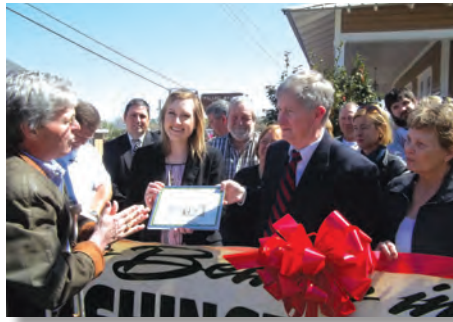
March 14 Law Offices of Baker & Tagert 1263 Jackson Avenue, Chipley