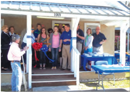
March 16 Panhandle Family Insurance 1069 Main Street, Chipley