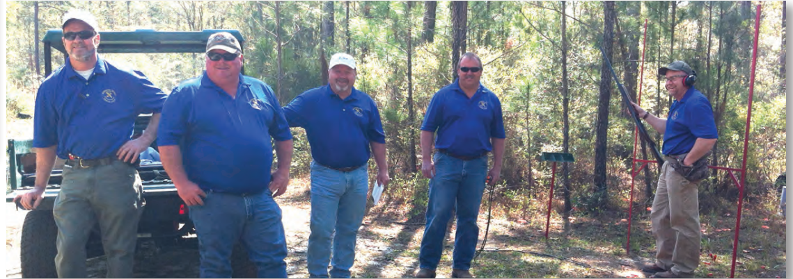
Hot shots make the mark at the Washington County Chamber of Commerce Clay Shoot Tournament March 22 • Hard Labor Creek Shooting Sports