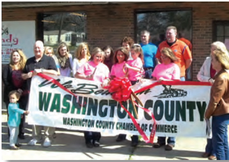
February 16 KJL | Kandy Boutique & Tanning 3005-A Main Street, Vernon