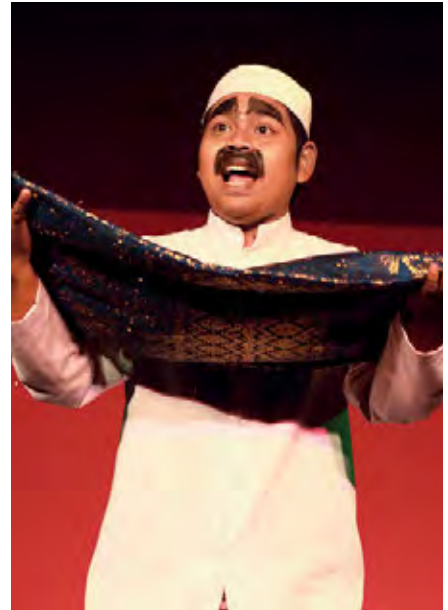
CLOCKWISE FROM ABOVE: Good triumphs over evil in Mak Therng – a folk tale reinterpreted through yike ; the Phloy Suoy is a harvest dance traditionally performed to invoke rain; a performer takes on the role of a Cham Muslim trader in a scene from Passage of Life ; the Passage of Life troupe comprises not only actors and dancers but also a traditional orchestra; a cheeky monkey teases the golden mermaid in Sovann Machha , a dance which depicts an episode of the Reamker or Khmer version of the Indian epic Ramayana .