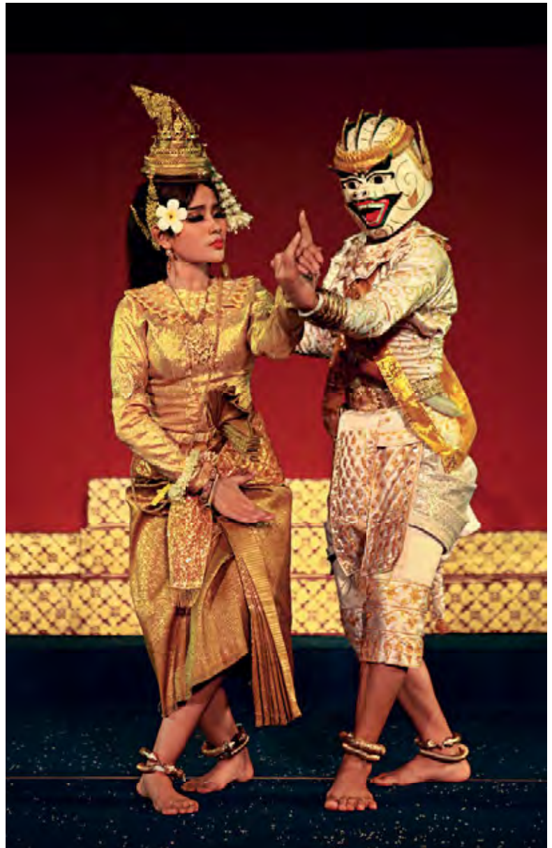
ABOVE: Performers acting out a scene based on the Reamker , when Hanuman, the white monkey meets and falls in love with Sovann Machha or the golden mermaid.

I understand now why back in dance class, so much emphasis was placed on gestures. Every move helps to tell the story and though the entire show is in Khmer, foreigners like me are able to follow the plot without referring to the English subtitles above the stage.