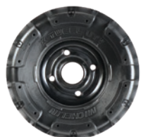
MSPN 68495, 67693, 65492, 64998 & 03488