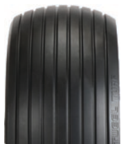
13" Grooved Polyresin Tread