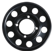
MSPN 21709 & 29242