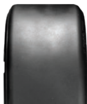
13" Smooth Polyresin Tread