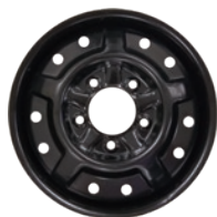
MSPN 49265 & 10545

Note: All UTV/ATVs use 60° / Conical / Tapered Lug Nuts.