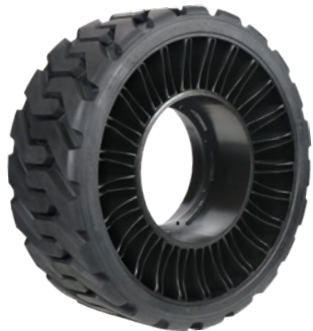
2-Piece Hub X TWEEL SSL shown without a hub adapter installed