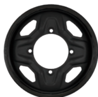
MSPN 75085 & 82599