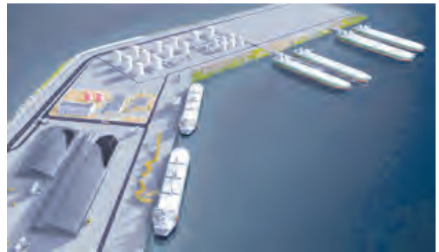
Third Package A

Al-Duqm Refinery will be built over an area of 900 hectares (1 hectare = 10,000 square meters) in Al-Duqm economic zone, which is located in Al-Wusta Governorate in south Oman, and overlooks the Arabian Sea. Having a total refining capacity of around 230,000 barrels a day at operation, the refinery will primarily produce diesel, jet fuel, naphtha, liquefied petroleum gas (LPG), petroleum coke, and sulfur. This location was chosen as part of Oman's efforts to develop the area and transform it into a center for energy and logistic services in order to diversify economic activities. The area's strategic location gains more significance considering that it lies on the shores of the Arabian Sea after the Strait of Hormuz and near international markets.