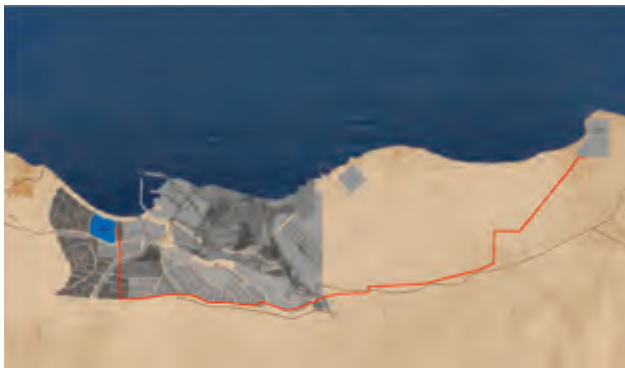
Third Package C