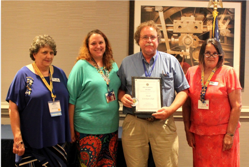
OUTSTANDING CLUB OF THE YEAR. ARAB CIVITAN CLUB