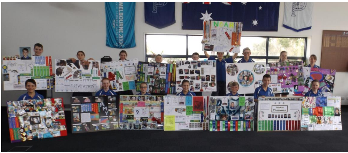
All Year 6 students displayed their ' Brag Boards ' at the Valedictory Dinner. Do you like them?