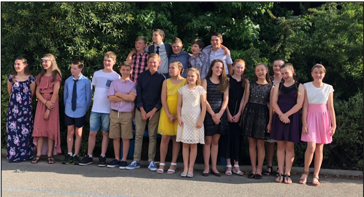
Class of 2017

The presentations soon began with each student presenting an acrostic poem to one of their peers as they were presented with their Graduation Certificates from their classroom teachers. Many special awards were then presented to the worthy recipients. Please read the next few pages.