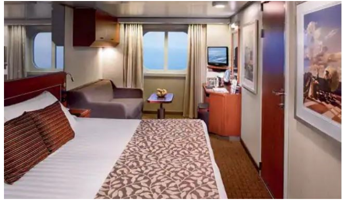
Oceanview rates start at $3659.00