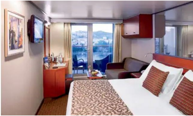
Balcony rates start at $4289.00