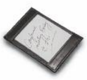
Note Holder & Cards LG 4207 Black Shell Cordovan LG 4208 Color 8 Cordovan