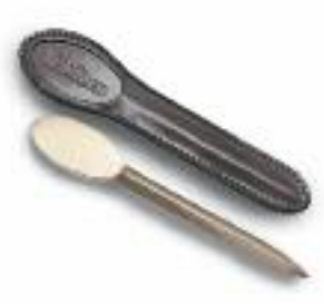
Letter Opener & Sheath LG 5207 Black Shell Cordovan LG 5208 Color 8 Cordovan