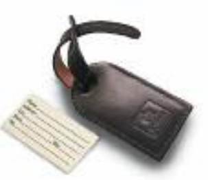
Briefcase Tag LG 1207 Black Shell Cordovan LG 1208 Color 8 Cordovan