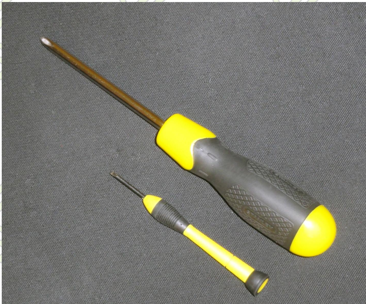
Fig. 1 - Required Tools