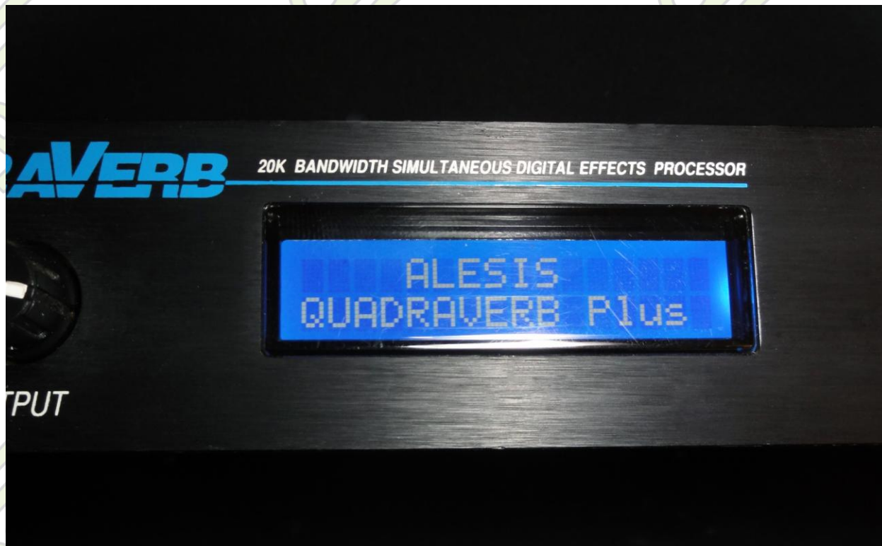
Fig. 6 - The LCD showing QUADRAVERB Plus message