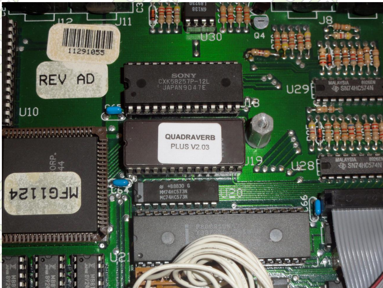
Fig. 5 - Quadraverb Plus chip installed into U19 socket