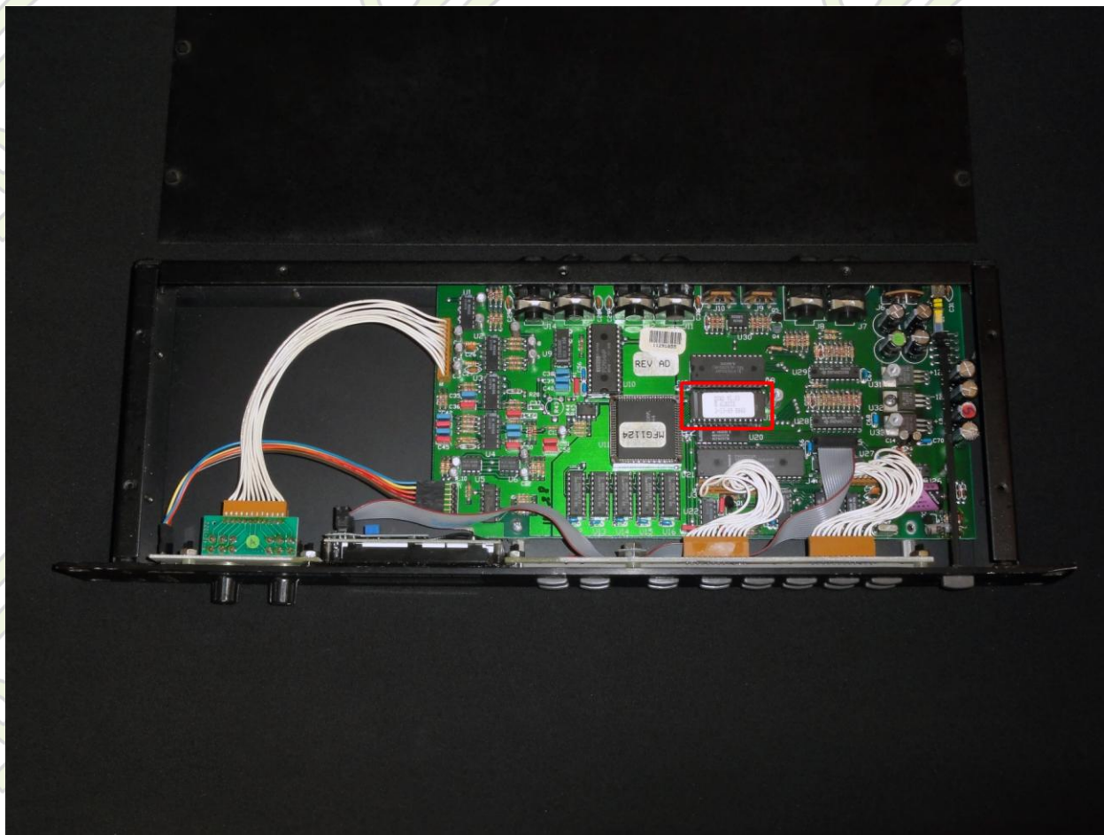
Fig. 3 - Original OS ROM location