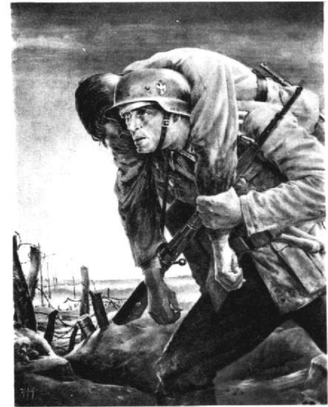
Nicht Du bist der Maßstab! Front!

Our aim is to carry on fighting the System, to prove that we won't submit, as we're an anti-System voice anywhere in the world.