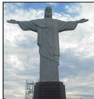
Christ the Redeemer

Our tour then commenced to a traditional Brazilian grill. This is where we had mystery salads of all sorts, and waiters brought beef, pork and lamb on swords. The waiters would then cut the meat off of the sword, and it would then fall onto your plate. I had beef, and it tasted like the sole of your shoe - very tough. Then I asked for more beef. The next cut was better, but not great. Finally, they had some really great salmon.