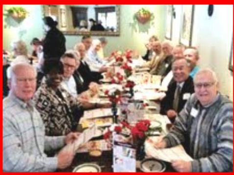
Enjoying time together!