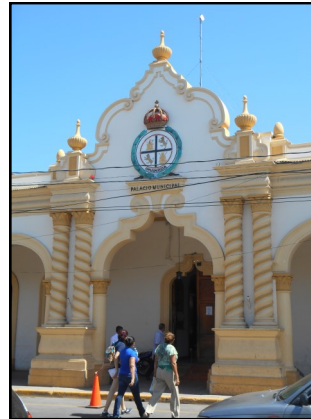
Church in Granada

We continued from the market to Granada. Granada was built in 1524 by the Spanish.