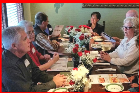
Lots of stories to share!