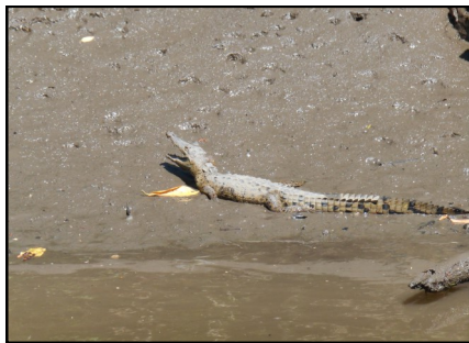
Crocodile on Muddy Bank

Costa Rica is a beautiful country with volcanoes, and rain forests. We took a tour on a boat. Along the way, we saw howler monkeys where the male monkeys hollered across the jungle. There were several sizes of crocodiles along the edge of the river. It was almost impossible to see the crocodiles. If I were hiking, I would have walked on them. (They looked like mud). There were scarlet macaws flying through the trees as our boat glided through tropical mangroves.