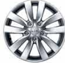
16" Alloy wheel