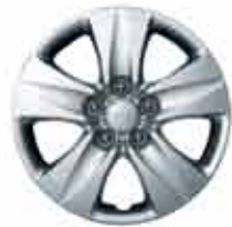
15" Steel wheel cover