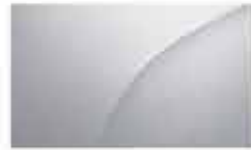
Snow White Pearl (P)