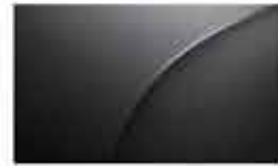
Glittering Metal (M)