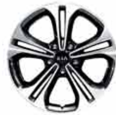
17" machined finished alloy wheel