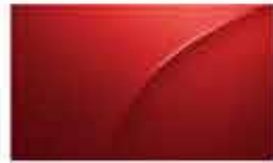
Temptation Red (M)