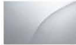
Bright Silver (M)