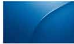
Coral Blue (M)