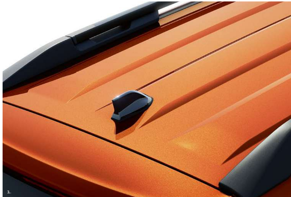
1. SHARK ANTENNA