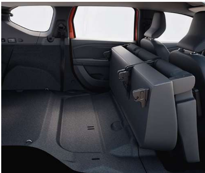
CAN BE CONFIGURED AS A 2, 3, 4, 5, 6 OR 7-SEATER

For long items, there's up to 1,807 litres of cargo space with the bench seat folded down. Make your journey more enjoyable and find your route with the multimedia system: 8-inch touch screen with Navigation, smartphone replication via wifi*, Bluetooth connection everything is there. A true Swiss Army knife style! *depending on the version