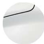
GLACIER WHITE (2)