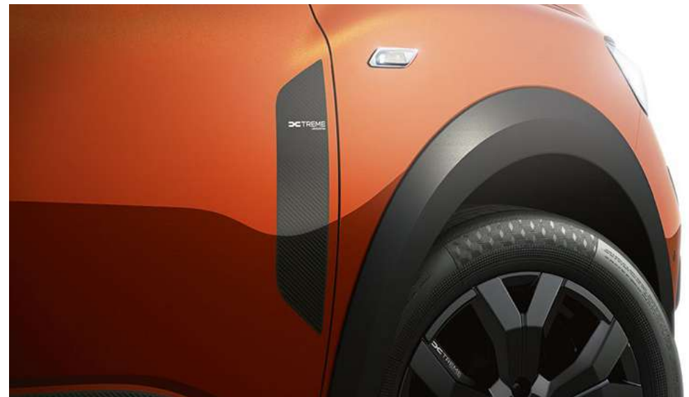
FLUSH WHEELS AND PRONOUNCED ARCHES