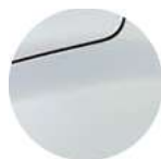
MOONSTONE GREY (1)