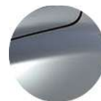
SLATE GREY (1)