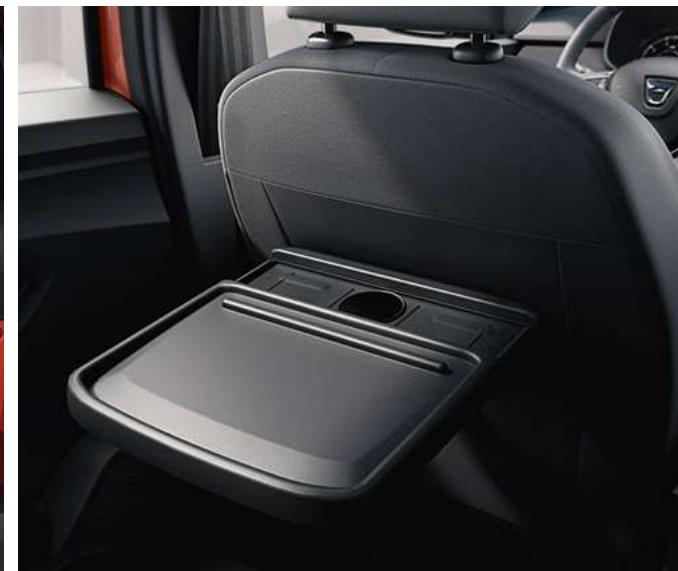
SLIDING TRAY TABLES AT THE REAR

*minimum boot volume of 160 L and a maximum of 1,807 L, depending on the version and configuration of the passenger compartment.