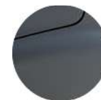
PEARL BLACK (1)