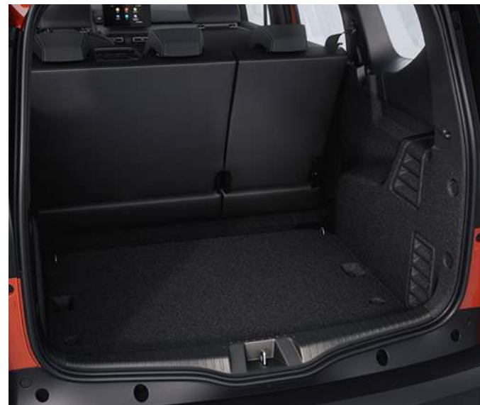
FROM 160 TO 1,807 LITRES OF BOOT VOLUME

*minimum boot volume of 160 L and a maximum of 1,807 L, depending on the version and configuration of the passenger compartment.