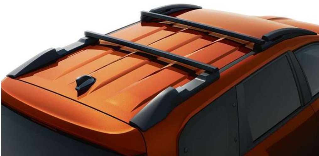
MODULAR ROOF BARS WITH A FEW TURNS OF THE KEY

access to the boot. Go all out with the Extreme Limited Edition: black-clad wheel arches, alloy wheels, door mirrors and shark-fin aerial. Distinctive stickers and protective Megalith Grey skid plates. All-New Dacia Jogger, designed for you and your family.