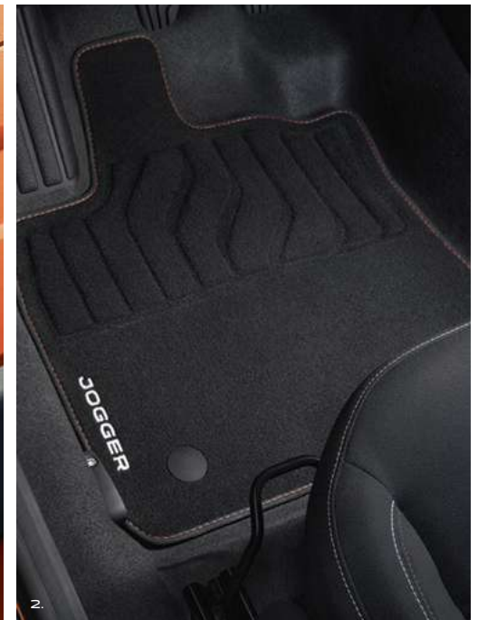
2. PREMIUM TEXTILE FLOOR MATS