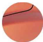
TERRACOTTA BRONZE (1)