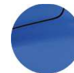
IRON BLUE (1)(3)

(1) Metallic colours - (2) Opaque colours (3) not available on the Extreme SE