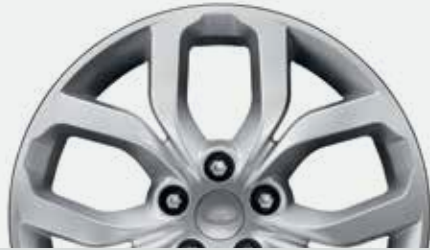
19" 5 SPLIT-SPOKE ALLOY WHEEL - SPARKLE SILVER

Wheel rim only. Center cap not included.