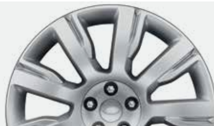
21" 9 SPOKE ALLOY WHEEL - SPARKLE SILVER

Wheel rim only. Center cap not included. Not available with coil suspension.