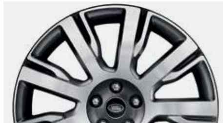
21" 9 SPOKE ALLOY WHEEL - DIAMOND TURNED FINISH

Wheel rim only. Center cap not included. Not available with coil suspension.