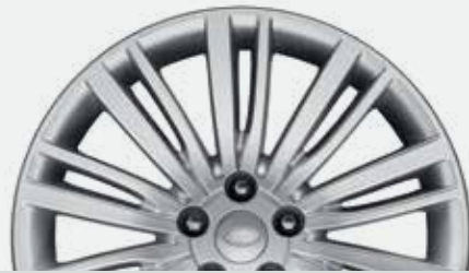
20" 10 SPLIT-SPOKE ALLOY WHEEL - SPARKLE SILVER

Wheel rim only. Center cap not included.