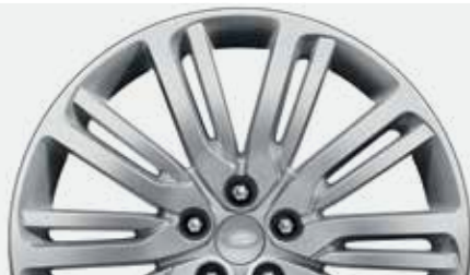
21" 10 SPLIT-SPOKE ALLOY WHEEL - SPARKLE SILVER

Wheel rim only. Center cap not included. Not available with coil suspension.