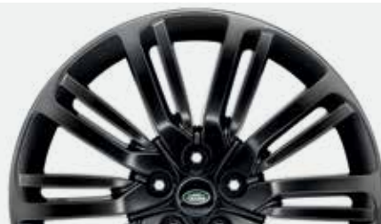
21" 10 SPLIT-SPOKE ALLOY WHEEL - GLOSS BLACK FINISH

Wheel rim only. Center cap not included. Not available with coil suspension.