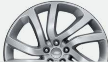
20" 5 SPLIT-SPOKE ALLOY WHEEL - SPARKLE SILVER

Wheel rim only. Center cap not included.