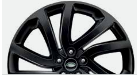
20" 5 SPLIT-SPOKE ALLOY WHEEL - GLOSS BLACK FINISH

Wheel rim only. Center cap not included.