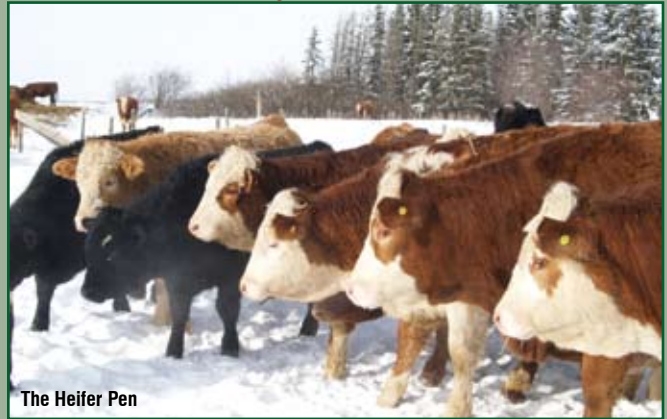
The Heifer Pen

A Lot: JLS ___X, Female, by LRX Jiro 5T -675594- 17 December 2010, BW: 100.