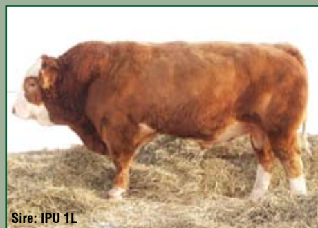
Sire: IPU 1L

A Lot: JLS ___ X, Male, by IPU Red Warrior 26S -PG663829- 11 December 2010, BW: 88.