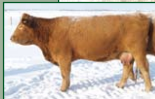
PRL SPANGLE 807S

JLS 360X is a polled red bull that is out of a Porter cow we purchased. He is a little smaller framed than the other red bulls, but is thick and has a good top and quarter. His full brother was one of our high sellers last year.