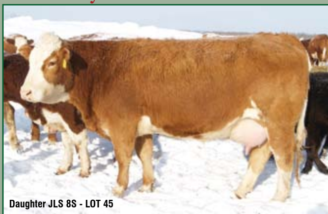
Daughter JLS 8S - LOT 45