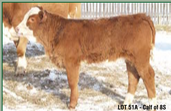
LOT 51A - Calf of 8S

A Lot: JLS ___ Y, Female, by Tatshenshini Napoleon (JLS 1N) -606972-17 February 2011, BW: 100.