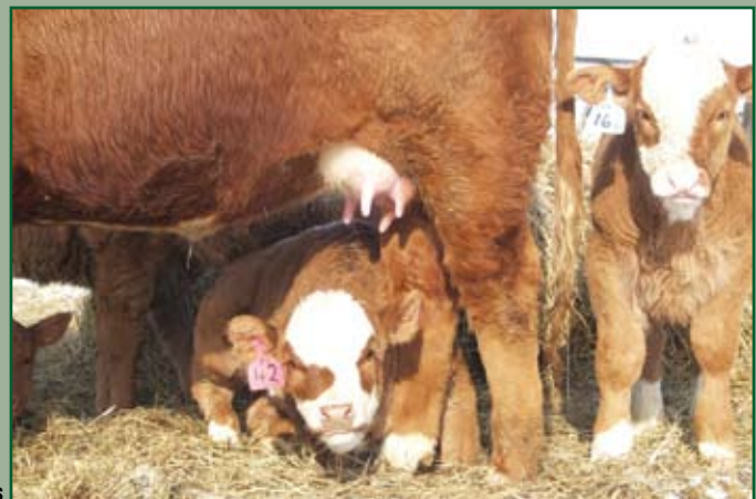
42N and 16M's calves