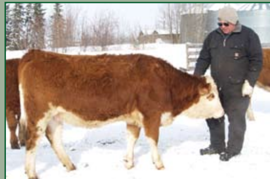
It is hard to get their heads up for pictures when they are this calm.