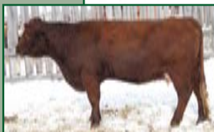
IPU RED MS QUORUM 15R