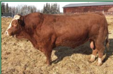
Lot 48 and 49 are full siblings out of MFL 73F and Napoleon JLS 1N

A Lot: JLS ___Y, Female, by IPU Red Warrior 26S -PG663829- 6 January 2011, BW: 94.