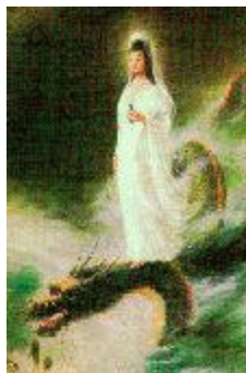
Ryuzu Kannon ( ? ? ? ? ) Buddhist Goddess of Mercy riding a dragon.