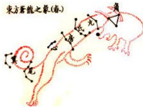
Another depiction of the Azure Dragon (The Blue dragon) Seiryu (青龍)

The heart of Scorpio. The three stars on line in the center of the constellation Scorpio represent the heart of Scorpio. The center star is the giant red star Antares. The Chinese looked on Antares as a star to be worshipped as a safeguard against fire. They named the giant red star Ho xin ( Huo Shing ) (火星), meaning "the Fire Star."