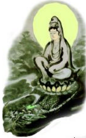
Ryuzu Kannon (音觀頭龍) Dragon Head Kannon