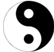
YIN YANG (陰陽)

Definition: The enso, a simple circle drawn with a single, broad brushstroke, is the Zen symbol of infinity. It represents the infinite void, the 'no-thing,' the perfect meditative state, and Satori (enlightenment.)