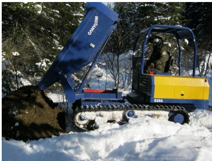
Allagash Ranger delivering gravel to the southern end of the Tramway Carry, winter 2010.

During the winter of 2010-2011 the Allagash Rangers have been moving loads of gravel across Chamberlain Lake to use for our Tramway Carry Project. The gravel has begun its journey at the Upper Crow's Nest campsite and in all the Rangers have done 48 seven mile long round trips to the southern end of the Tramway Carry.