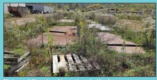
Plate and Structural Inventory in Yard

Large Quantity Welding Accessories, Tooling, & Support Equipment