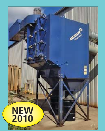
lesser Model DFT4-32 Cartridge ype Dust Collector