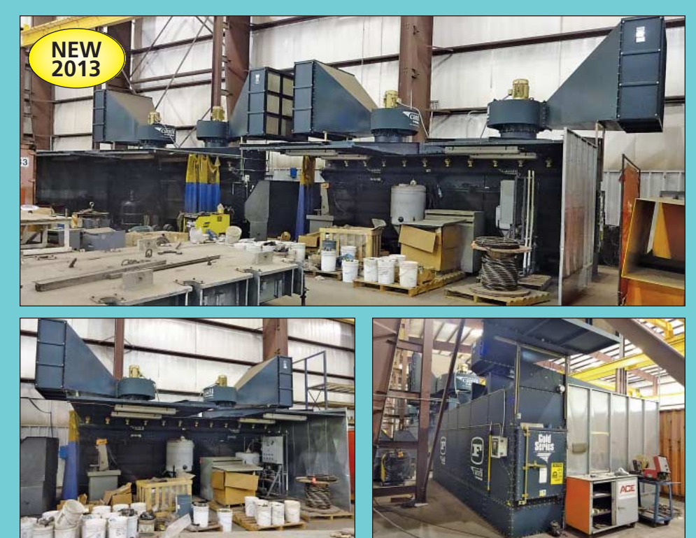
(2) 10' x 22' Approx. Farr Camfill Gold Series Model GSB24-3 Booths for Stainless Welding