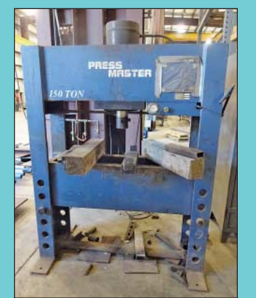
150 Ton H-Frame Press Master Hydraulic Press