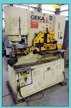
5" x 5" x 1/2" Geka Hydracrop 70 Ironworker