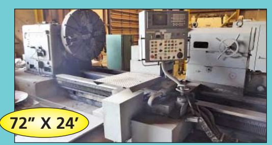
72" x 24' (Approx.) Niles Zerbst Heavy Duty Flat Bed CNC Engine Lathe

52,000 Lb. Towmotor Model AH-52 Diesel Power Lift Truck