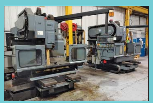
(2) Makino FNC Heavy Die Mold CNC VMC's