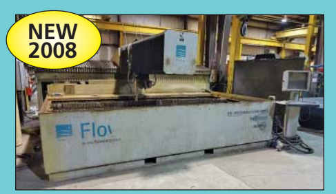
Flow Model IFB CNC Water Jet Cutting Table