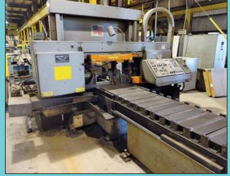
18" x 20" HEM Model H130HA-DL Automatic Horizontal Band Saw