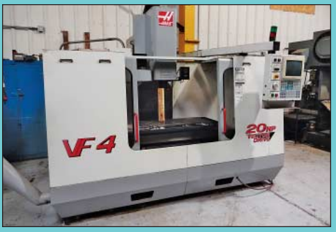
Haas Model VF4 CNC Vertical Machining Center