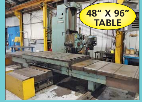
4" Nomura / Olympia Model B-100WB Four-Axis Table Type CNC Horizontal Boring Mill