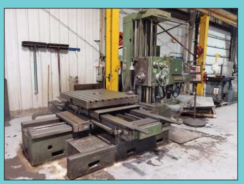
4" Sacem Hercules Model MST-XC-110 Rotary Table Horizontal Boring Mill