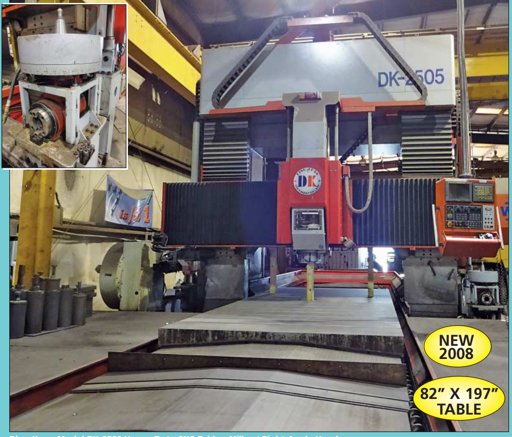
Ding Koan Model DK-2506 Heavy Duty CNC Bridge Mill w/ Right Angle Head