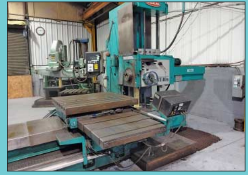
4" Shibaura Model BT10B-R1 Rotary Table Horizontal Boring Mill