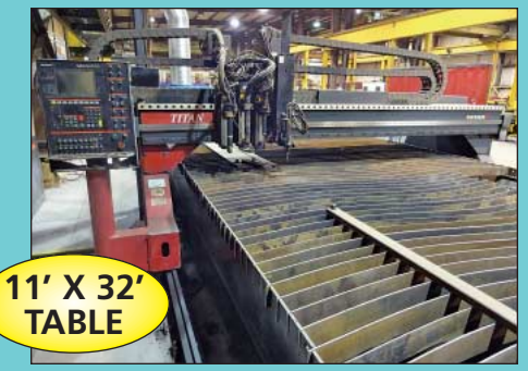
11' x 32' Messer Model Titan 40/4LP CNC Plasma Table