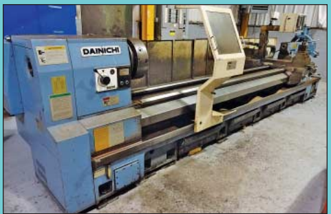
30" x 157" Dainichi Model DL-75X400 Flat Bed CNC Lathe