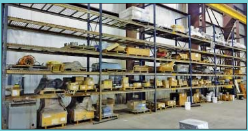
Various Parts Including (30+/-) Large Bearings