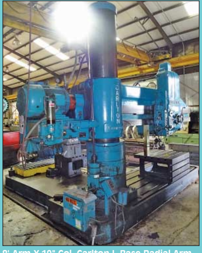
8' Arm X 19" Col. Carlton L-Base Radial Arm Drill