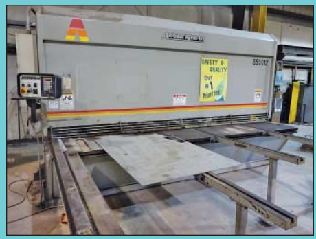
1/2" x 12' Accurshear Model 850012 Hydraulic Squaring Shear