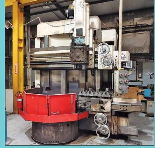
48" Bullard Model Cutmaster Vertical Turret Lathe