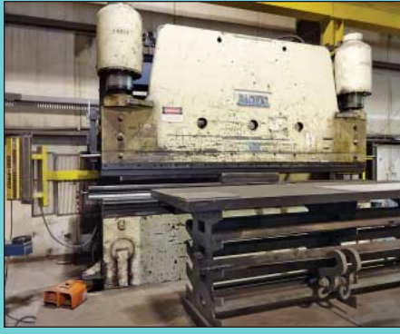
400 Ton x 12' Pacific Model K400-12 Hydraulic Press Brake

Kao-Ming Model KMC-4000SD CNC Bridge Mill