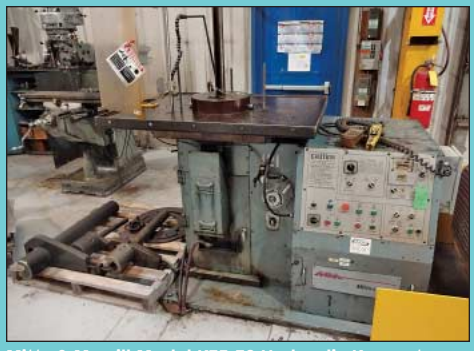
Mitts & Merrill Model K35-30 Hydraulic Keyseater