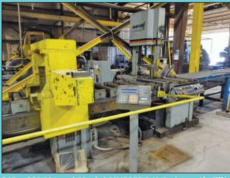
21" x 22" Marvel Model MV525PC/1 Automatic Tilt Frame Vertical Band Saw