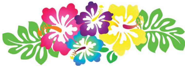
EXHIBIT BOOTH DECORATING CONTEST

Break out the ukuleles, tikis and florals to decorate your booth with this year's HAWAIIAN theme. Attendees will vote on their favorite Best Decorated Booth while visiting the exhibits.