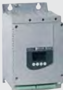
Altistart 48 17 to 1200 A