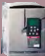
Altivar 58 0.37 to 55 kW