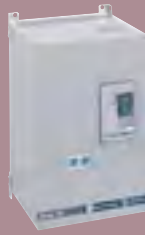
Altivar 38 0.75 to 315 kW