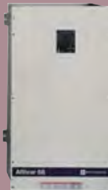
Altivar 68 75 to 630 kW