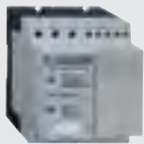
LH4 6 to 85 A