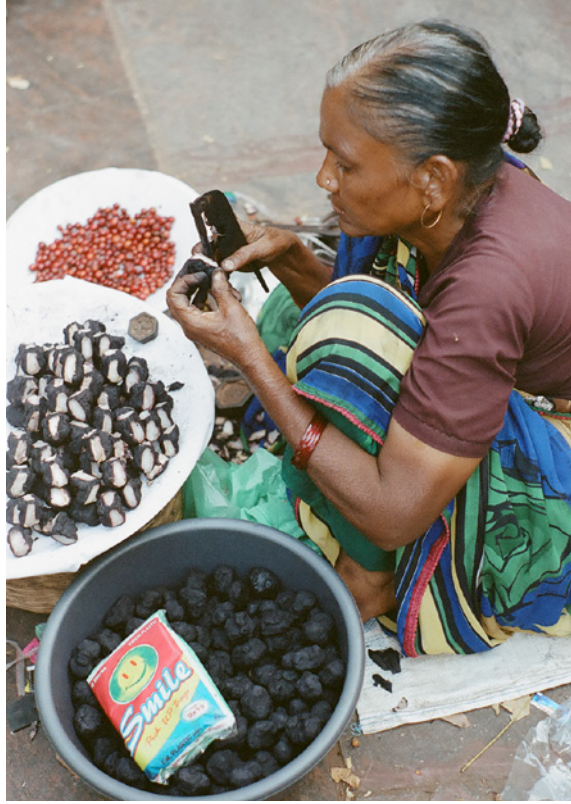
Old Delhi, Street Market.