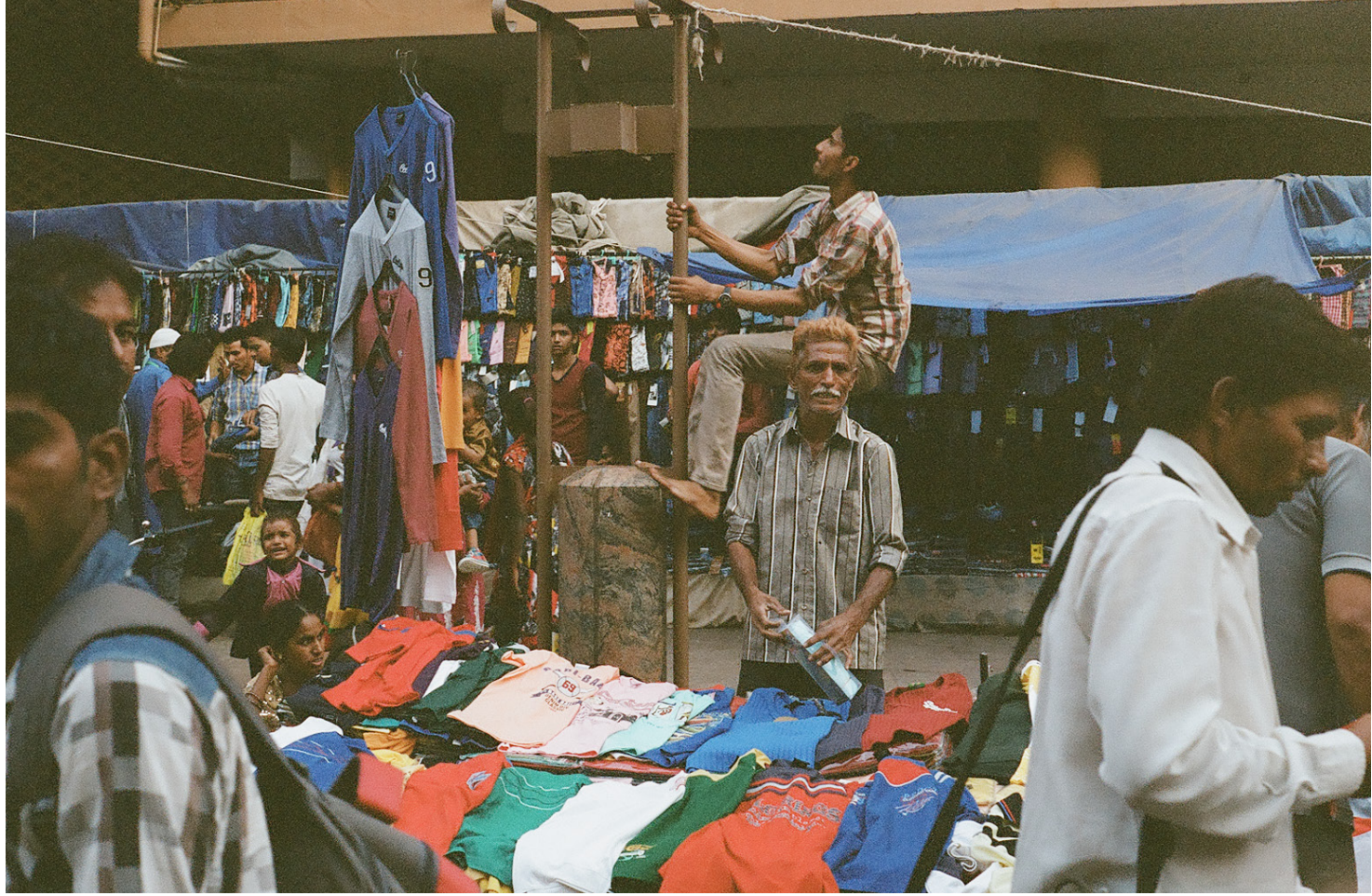
Old Delhi, Street Market.