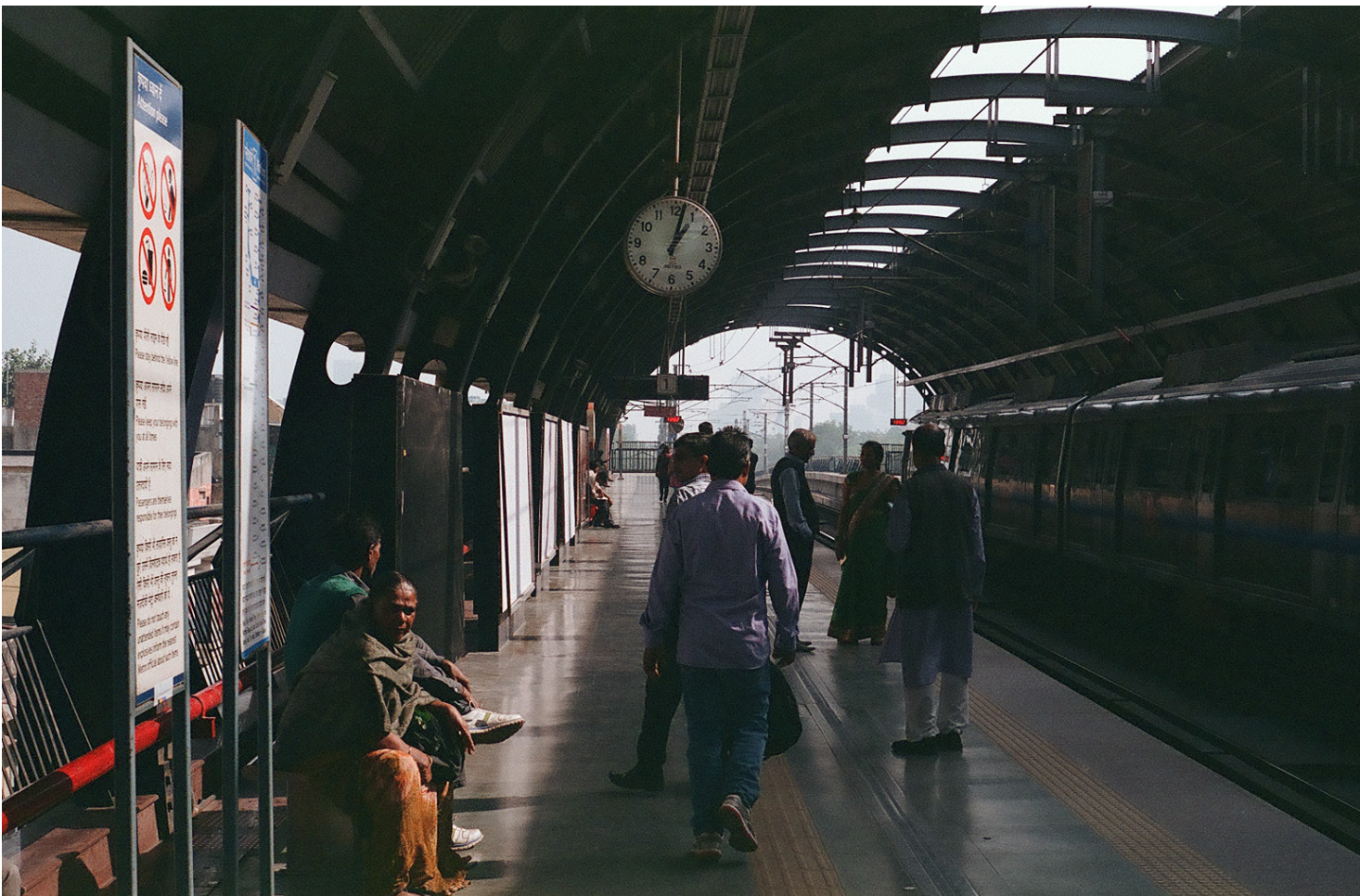
Delhi, Metro Station.