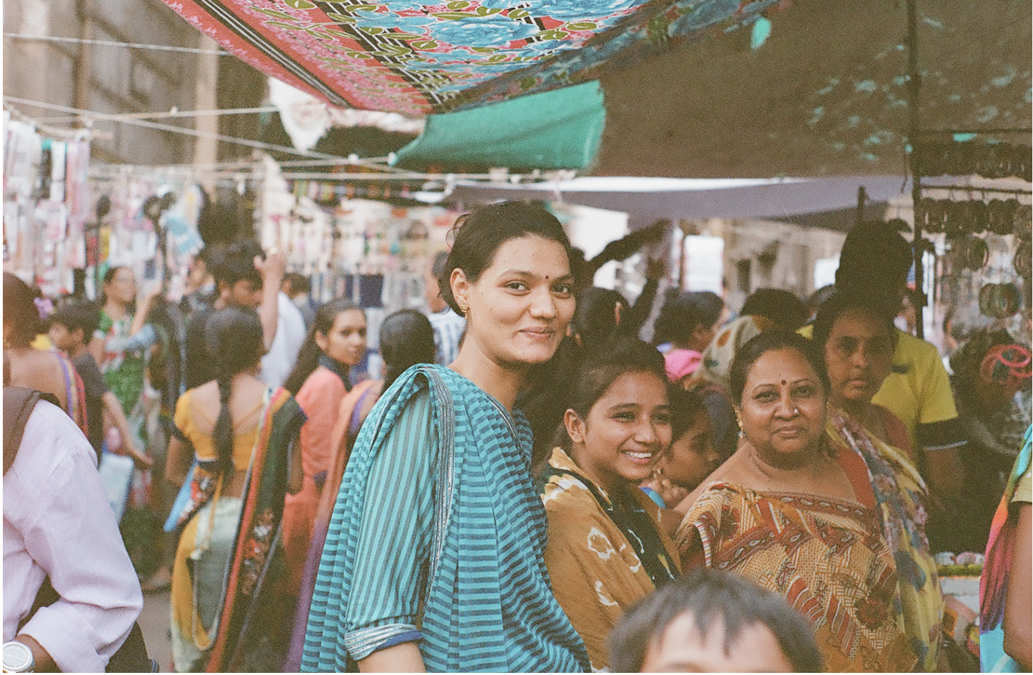
Old Delhi, Street Market.