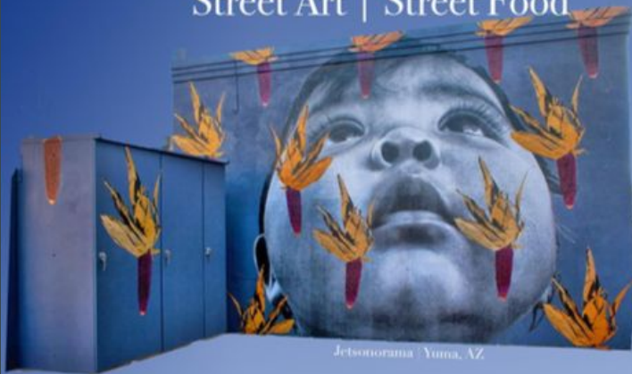
Jetsonorama / Yuma, AZ

Here at CC, we believe that access to art is a human right. That's why we've partnered with the Southwest Studies department to bring you URBAN LEGEND, a collection of street art from all around the Southwest powered by the magic of guerilla projection! Come see this once-in-a-lifetime presentation of art from local and global legends, hear the stories behind the art, and witness a variety of music, theater, and performance art! No two stops are alike!