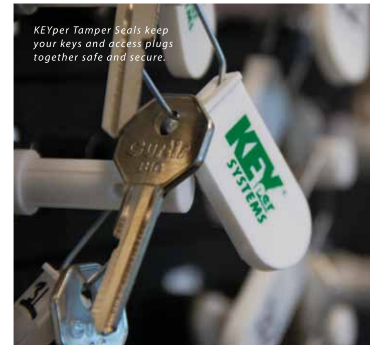
KEYper Tamper Seals keep your keys and access plugs together safe and secure.