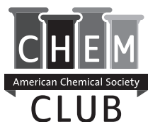
Secondary Usage Grayscale Logo