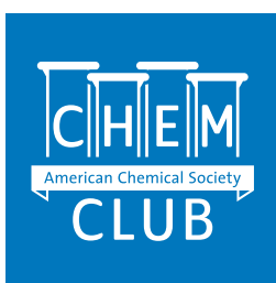
Secondary Usage Reverse Color Logo