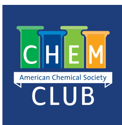
Secondary Usage Reverse Color Logo