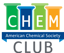
Preferred Usage Full-Color Logo

The ChemClub logo can be reproduced in white on a black, ChemClub Dark Blue, ChemClub Light Blue, and ChemClub Dark Green background. This is called a “reverse.” In order to maintain sufficient contrast between the logo and its background, please ensure that the logo is only reversed out of a dark color background where the logo is legible. If the ChemClub logo is superimposed upon or reversed out of a photograph, it should always be placed in an area that offers a consistent background and gives sufficient contrast.