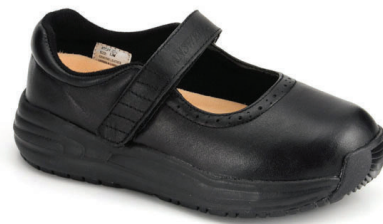
New Balance Shoes