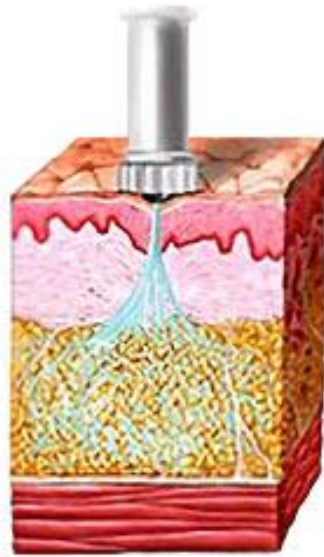
Insulin jet injector