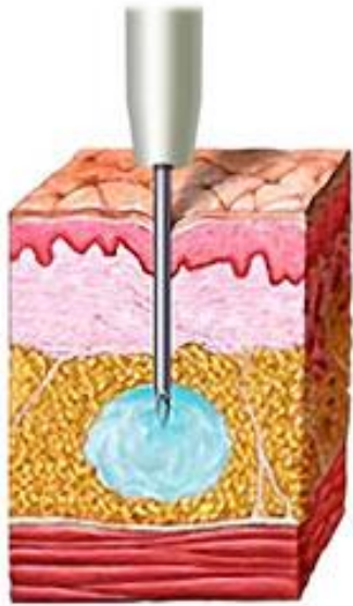
Insulin pen injector