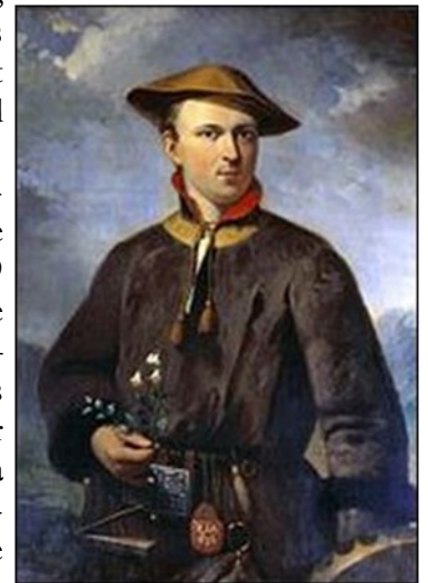
CAROLUS LINNAEUS 1701-1778

Our ideas about rhododendron species and relationships are changing constantly. The current texts place the thousand or so rhodie species in 8 or 9 subgenera, but DNA evidence from the late 1990s suggests that there are only 4 subgenera. That kind of evidence is probably nearer to “reality” than our previous ideas were. Still, our idea that there are nearly a thousand separate species of rhododendrons in the Himalaya probably fits the definition: “form or appearance of a thing as opposed to its reality”. It should be much harder to hybridize between species than it is if the species we assign names to were real. The idea of assigning names to plants to distinguish one from another helps us understand them better, though, so let’s continue to celebrate form or appearance of our rhodies until we have something better.