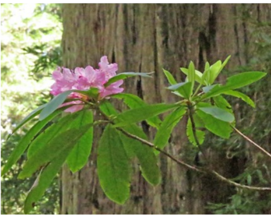
Rhododendron macrophyllum SYNONYM: Rhododendron californicum

Carolus Linnaeus (Karl Linné), in the eighteenth century, used his ideas for classifying plants and gave us the genus name Rhododendron . Botanists who assign scientific names (taxonomists) have been using that idea ever since to describe our favorite genus. Unfortunately for those of us who live in this part of California, the name of our native rhodie, Rhododendron macrophyllum , was changed when I was taking a taxonomy class in the 1950s. Formerly it was named Rhododendron californicum , but a person in Washington state discovered that it had previously been named R. macrophyllum so Linnaeus’ idea of priority dictated that the name we have today must be used.