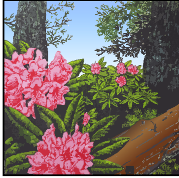
Eureka Chapter American Rhododendron Society