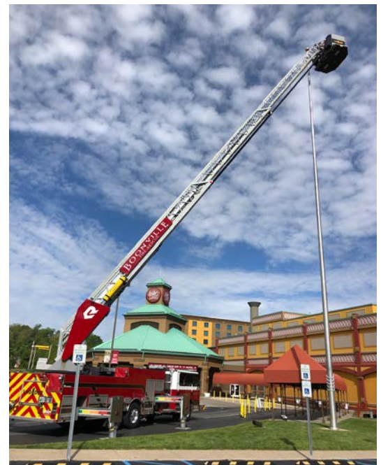
New Ladder Truck

Improvements Accomplished from Local Gaming Revenues