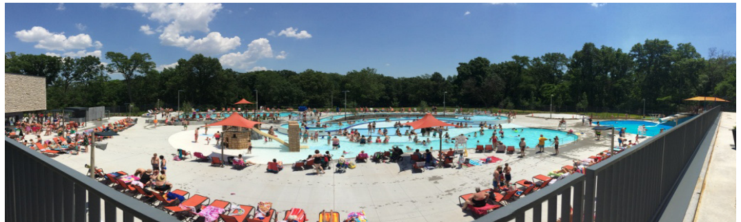
Lemay Pavilion Community Center Pool Project