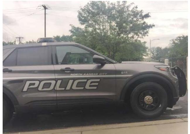
New Police Car

Improvements Accomplished from Local Gaming Revenues