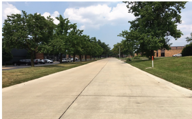
Worthington Access Completed

Improvements Accomplished from Local Gaming Revenues