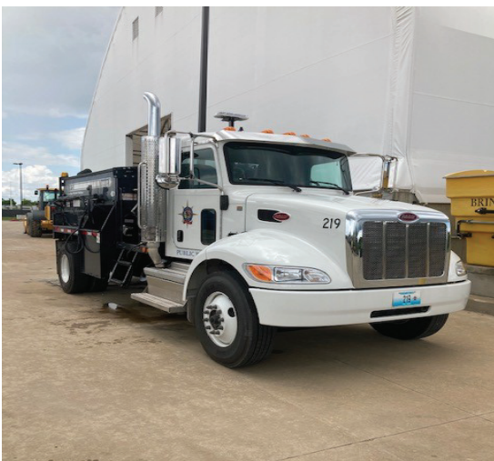
New Specialized Equipment