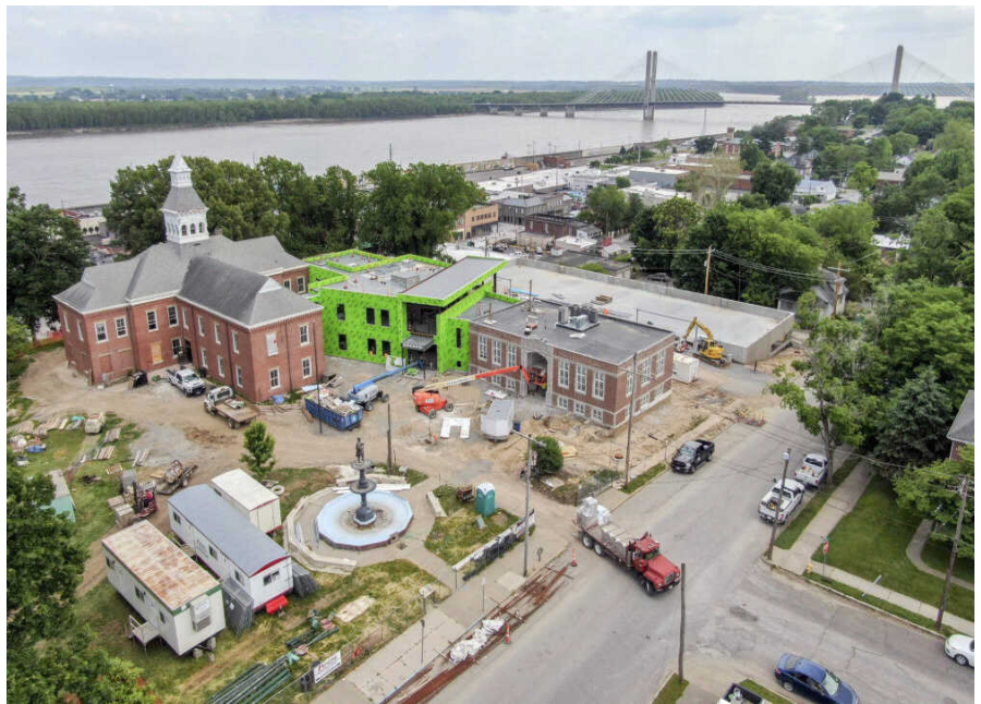
City Hall Project

Total Capital Investment in Property since Company Purchase: $139,974,640 Total Capital Investment in Property for Fiscal Year: $1,468,146 Total Employee Compensation: $10,136,811 Real Estate/Personal Property Tax: $1,028,344 State Sales Tax: $105,350 State Withholding Tax on Jackpots: $789,155 Federal Withholding Tax on Jackpots: $1,173,954 Charitable Donations: $53,848 Charitable Contributions By Patrons: $2,926 Total Employment: 243 Minority Employment: 41 Female Employment: 108