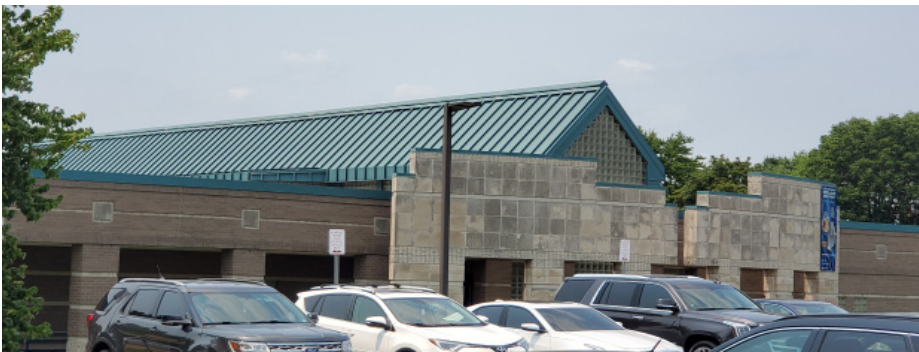
South Patrol Metal Roof