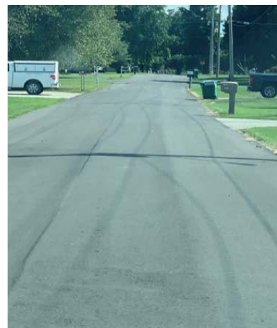
Street Pavement Carroll Avenue