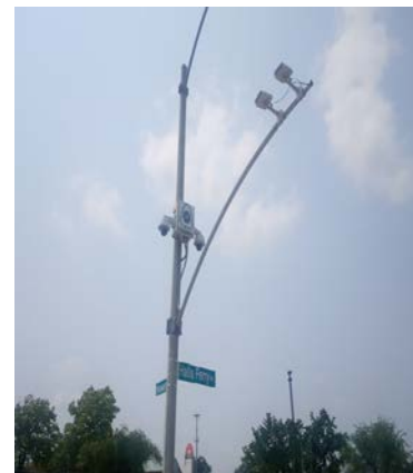
Halls Ferry Circle

Improvements Accomplished from Local Gaming Revenues