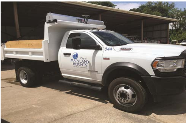
Public Works New Dump Truck