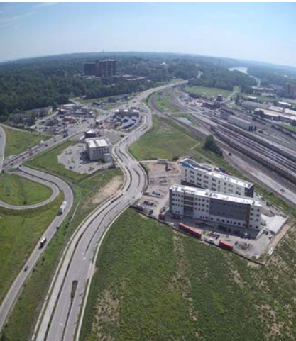
Diamond Parkway Spine Road