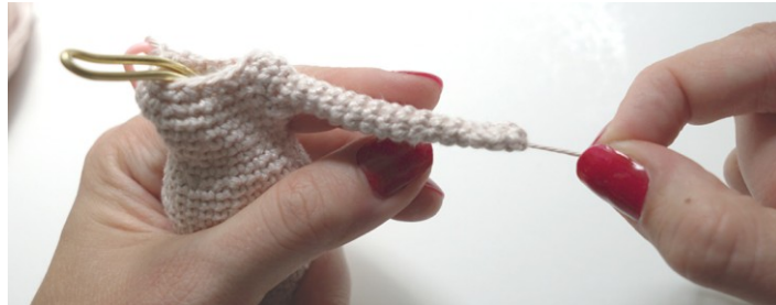
Figure 6: the create the look of a [flat] hand, you can sew both sides of the hand together

=> before continuing with the rest of the body, insert a wire into the arms so that both arms are connected through that new wire. Attach the arms-wire to the wire you used for the legs (and the body). I twisted the arms-wire to the body-wire to fix them together: