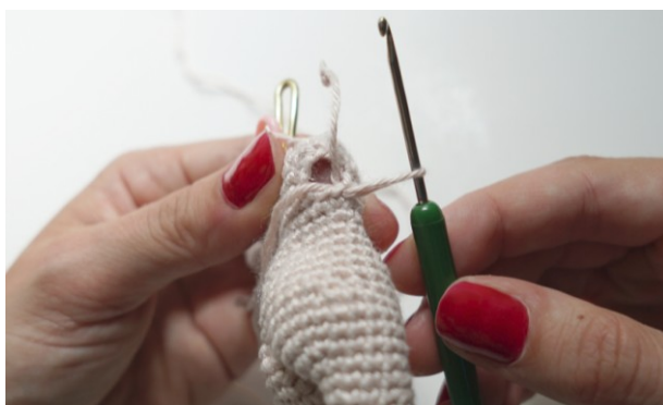
Figure 5: the arm is a continuance from the body with a new yarn