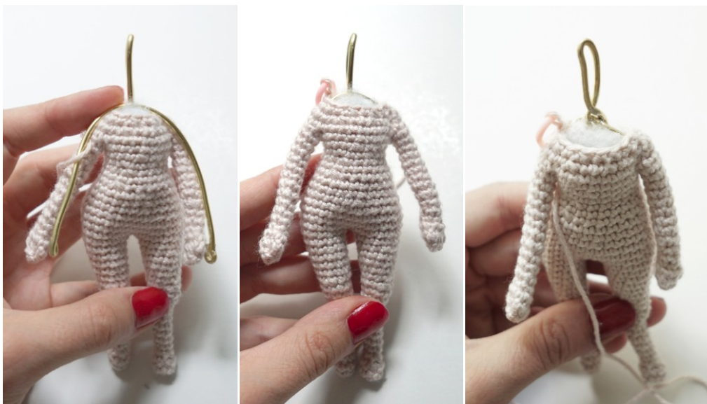
Figure 7: the wire for stabilizing both arms should be attached to the wire used for the legs and the body

38. Rd: dec every 2nd sc, 1 sc in last 2 sts (5x) (12)