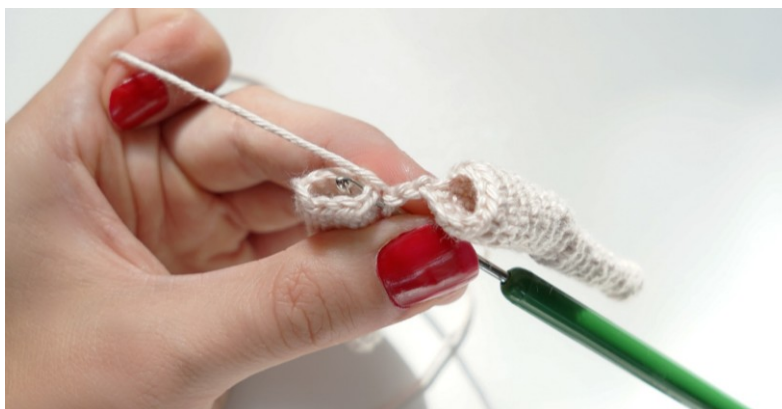
Figure 1: connect both legs by chaining 2 sts at the end of the 2nd leg and sc through the 5th-last st of the 1st leg

chain 2 and sl st in the 5th last sc from the 20.Rd of the 1st leg (i.e. connecting both legs onto 2 chain sts; see Figure 1)