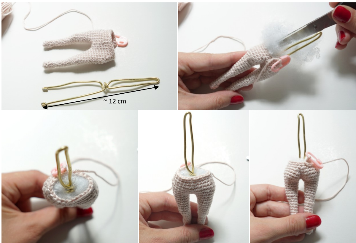
Figure 3: employing the wire into the legs. As the wire is also used to stabilize the entire body, its length should go appr. up to the head

=> now, integrate the wire into the legs. Thereby, make the wire as long as the doll (~12 cm), that will stabilize the body; in case you use a wire of 2 mm, stuff the thighs (not the lower legs!) additionally with wadding until it appears thick and tight (Figure 3). With a wire of less than 2 mm, you can lightly stuff the lower legs as well.