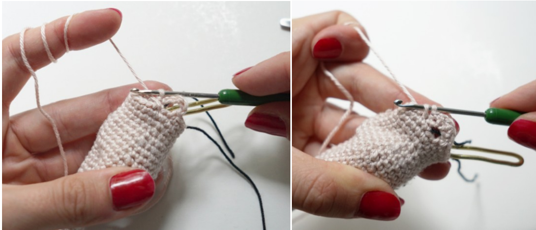
Figure 4: working the arms into the body by chaining 5 sts and leaving out one sc from the base round