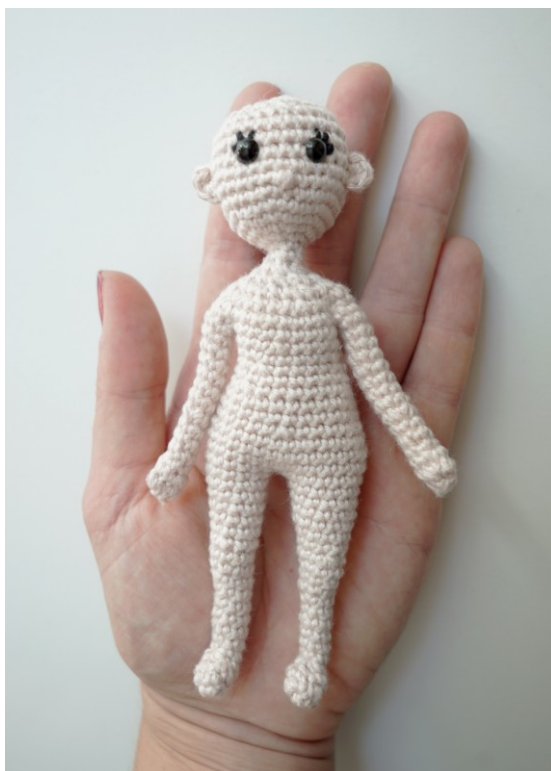
Figure 8: finished body of the amigurumi doll (without hair)

The finished body should look something like this: