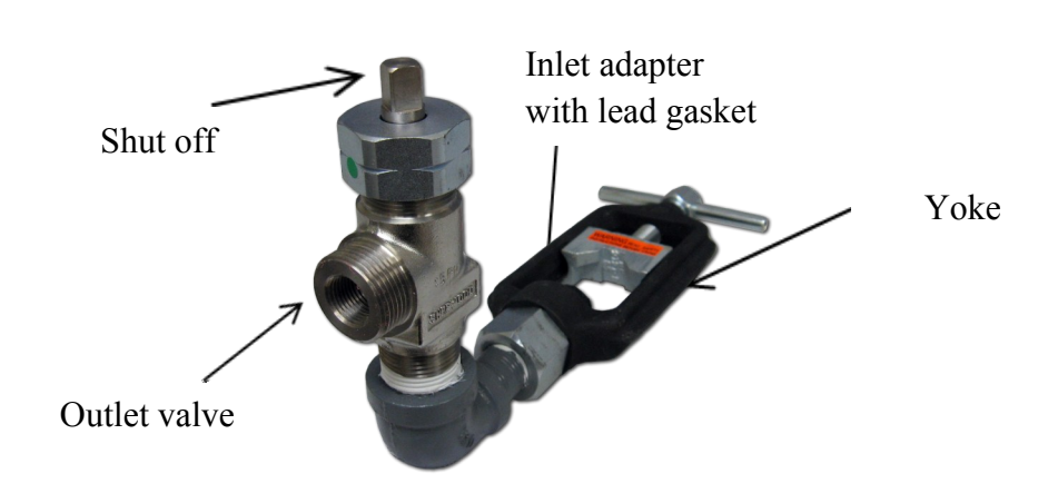
Figure 6. Auxiliary Valve for Container Connection

It is strongly recommended that auxiliary valves be used on all container header valves. This will greatly reduce the chances of ammonia leaks and increase the lifetime of the flexible connectors. Auxiliary valves can also be used to prevent air from entering the flexible connectors and manifold piping. Auxiliary valves come with a yoke for mounting onto the container valve with a lead gasket and an adapter to fit around the thread. This leads out into another header valve where the flexible connector can be attached. The auxiliary valve allows for gas to be shut off right at the container. See figure 6 for a detailed auxiliary valve drawing.