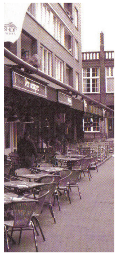
Above: Typical cafe seatting