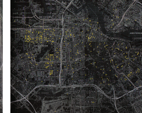
Above: Neighborhood parks in 1954