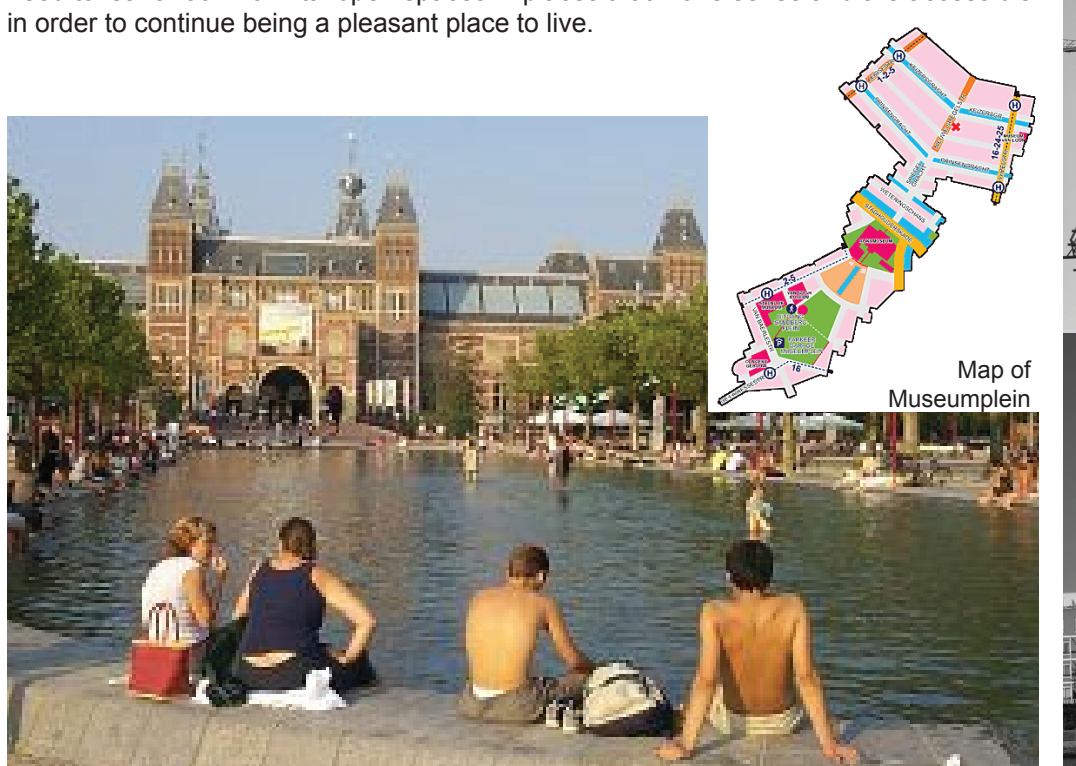
Above: People at the Museumplein