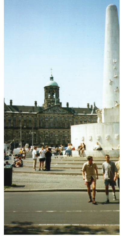
Above: Photograph of Dam Square