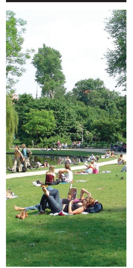
Top : Summer day in Vondel Park Below: Fall in Vondel Park