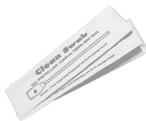
Removes dirt and debris from the print head extending the life of the print head and maintaining a readable image. Excellent for intermittent cleaning during printing process and at time of media change – Reusable – 50 Per Box

6880 South Emporia Street Centennial, Colorado 80112 303-790-0885 – 303-790-0746 – FAX Toll-Free: 1-800-525-7059