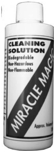
D1111 Dollar Bill Validator Cleaning Solution. 4-Oz Bottle W/Applicator Cap