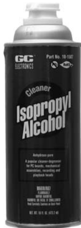
D0257 Isopropyl Alcohol Non-Aerosol Can. Refined, Top Grade Alcohol For Use With Swabs, Cleaning Cloths Or Trigger Sprayer. 16 Oz Can