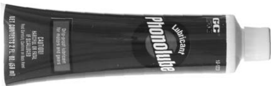
D0125 – Phonolube

Super Lube Oil With PTFE Is A Premium Synthetic Oil With Suspended PTFE Particles That Bond To Surfaces Of Moving Parts. Suitable For Extended Service Applications And Through A Wide Range Of Temperatures. It Provides Protection Against Friction, Wear, Rust And Corrosion. Will Not Separate And Is USDA Approved. Super Lube Is Safe On Metal, Rubber, Plastic, Wood, Leather, Fabric And Painted Surfaces. 0.25 Fluid Ounce Applicator