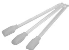
Plastic Handle Swabs Contain IPA And Are Snapped To Release The Cleaning Agent Onto The Spatula- shaped Foam Tip. The Wide Tip features Fast Cleaning And Good Area Coverage. 25 Swabs/Box.