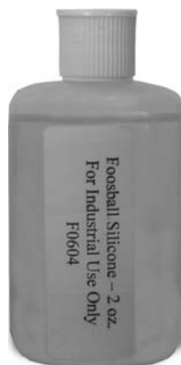
F0604 – Foosball Silicone

Superior Calcium Stearate Based Grease Compound With Excellent Dielectric Properties For General Use. Provides Excellent, Long-Lasting Lubrication For Bearings, Tools, Appliances, Machines, Electronic Equipment, Etc. 2-Oz. Tube