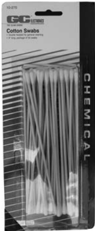
D0258 – Double-Ended Cleaning Swabs Durable Cotton Tips On Both Ends. Excellent For Use With Alcohol, Tricholororthan, Etc. 6" Length, 50 Swabs Per Pack.