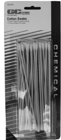
D0259 – Lint-Free Poly/Cotton Swabs Gentle Enough For Cleaning Delicate Surfaces. Reusable If Used With Alcohol. 30 Swabs Per Package.