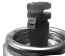
Krylon's Fan Spray Nozzle Insures Fast, Even Coverage