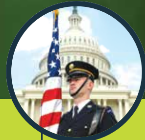
National Memorial Day Concert 2021