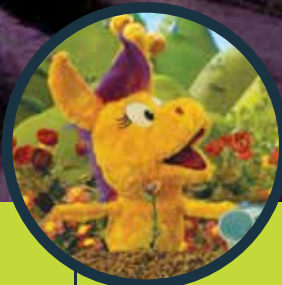
New from PBS KIDS: Donkey Hodie