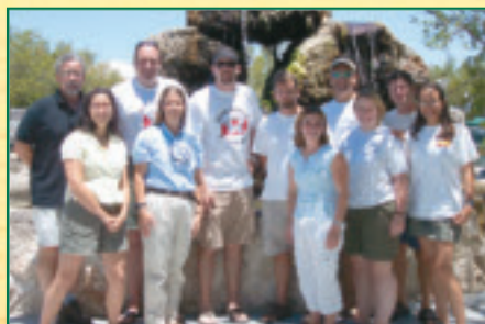
Participants in REEF's 2005 EAC meeting in Key Largo.

grant from NOAA's Coral Reef Conservation Program. Special thanks also goes to Island Dolphin Care for hosting the event at their terrific new interpretive and meeting center, Horizon Divers for taking the participants out on the water, and to REEF Interns for help with logistics and facilitation.