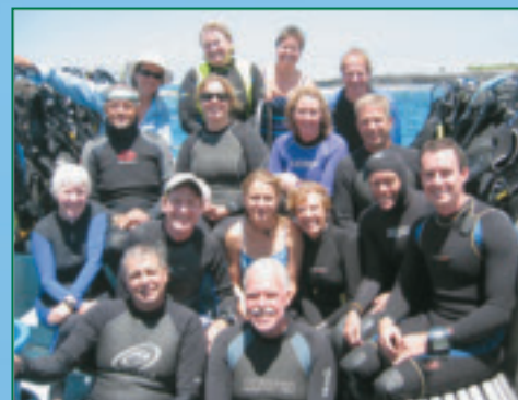
Sixteen REEF members joined in the fun during the 2005 Field Survey to Kona, Hawaii.