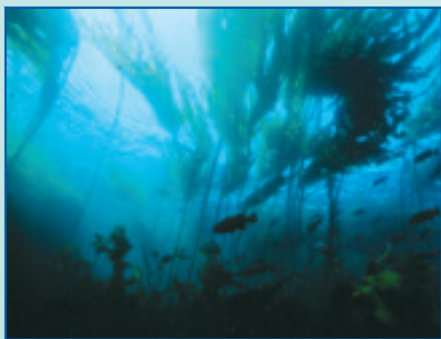
Rich kelp forests dominate the nearshore underwater landscape of the Olympic Coast.