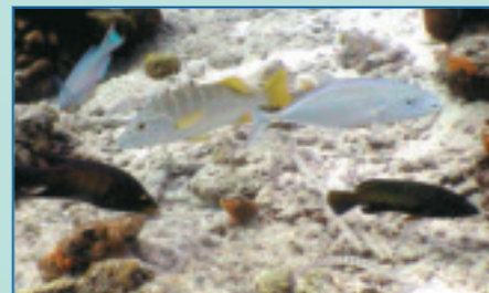
A mixed species foraging group such as the one shown here could enhance the strength of particular species co-occurrences, as discussed in Auster, et al.'s paper using REEF data from Bonaire.