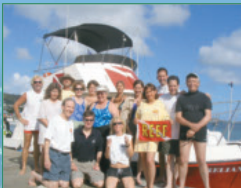
Participants on the 2005 St. Croix Field Survey broke all records by documenting 243 different fish species during their week-long diving adventure.

“ REEF survey trips are the perfect way for me to take a dive vacation with a great group of people, go places I might not go on my own, improve my fish ID skills and do something good for the planet.” - B. Brown, Field Survey Participant