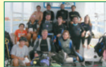
Cozumel Marine Park staff and volunteers get ready to conduct a fish survey as part of a recent REEF Regional Capacity Building Seminar held in Mexico.

REEF is very excited by the success of these seminars, and thanks in large part to funding received from the National Fish and Wildlife Foundation for our Field Station Program, we will be coordinating several more Capacity Building Seminars throughout our project regions over the next year.