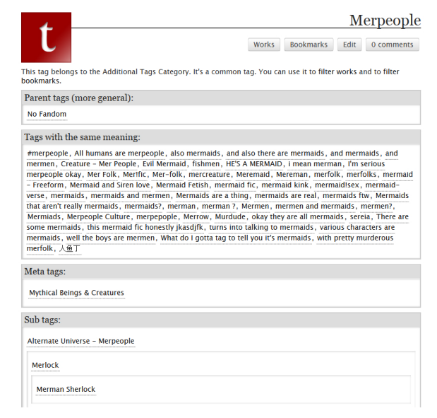
Figure 2. Tag Wrangler view of a tag page on AO3

Another group essential to the functioning and design of the archive are the "tag wranglers." AO3 has a complex tagging and search system infrastructure based on the principles of user-entered folksonomy [29]. Wranglers' main duties involve manually coagulating and connecting all of the new "canonical" tags that users create so that users can freely tag their works however they wish without negatively impacting the site's search potential. For example, tag wranglers would manually connect "mermaid," "merman," and "merfolk" into one "merpeople" meta tag, invisible to users, that allows searching any one of these tags to bring up all the others.