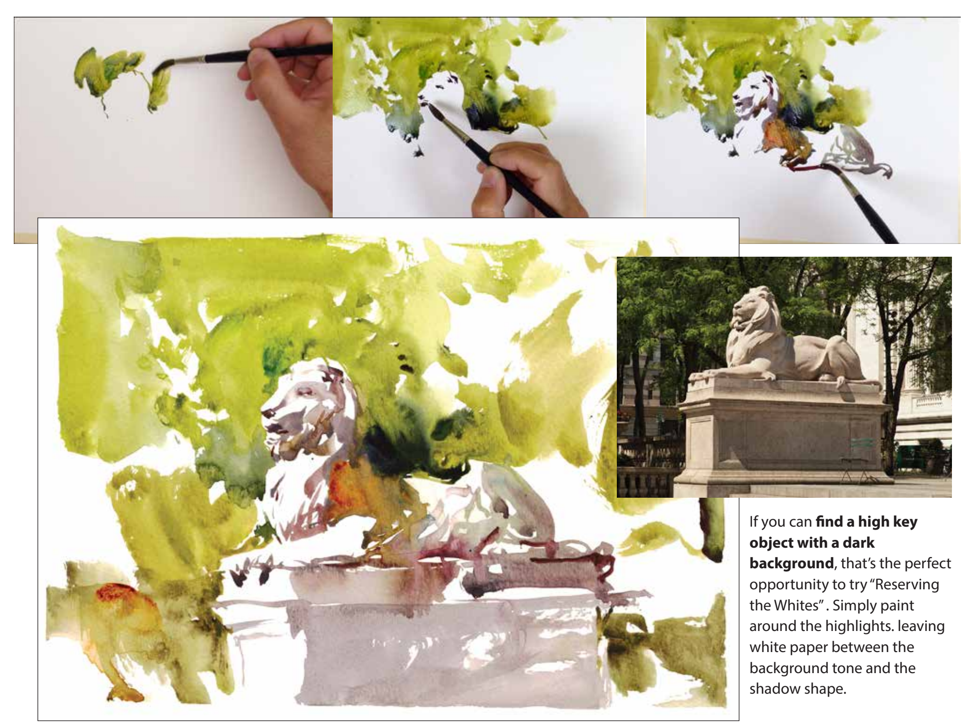
THE BACKGROUND DOESN'T HAVE TO BE FLAT - ESPECIALLY IF IT'S TREES OR CLOUDS.