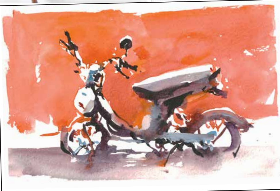
If you get (unwanted) hard edges inside your background, you're probably going too slow. Try premixing color, or use a bigger brush. And don't stop where you don't want an edge.