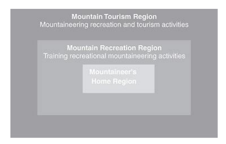
Figure 1: The relationship between the tourism and recreational region for mountaineering

Figure 1 (TM 2006) usefully illustrates the relationship between tourism and recreation relative to mountaineering. It demonstrates that recreational mountaineering can and often does precede mountaineering tourism. For instance, mountaineers residing in north Wales can partake in day-long mountaineering trips from their home region to the Welsh mountains during the entire year while also participating in holidays several times a year to the Scottish mountains, the Alps or mountainous regions located further afield. Recreational mountaineering trips can develop participants' skills and experience for future mountaineering holidays, and hence they can serve a training purpose. Although this example specifically relates to mountaineering, it also applies to many other adventure activities such as rock climbing, paragliding and canoeing.