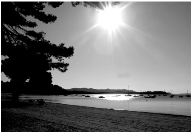
On the beach