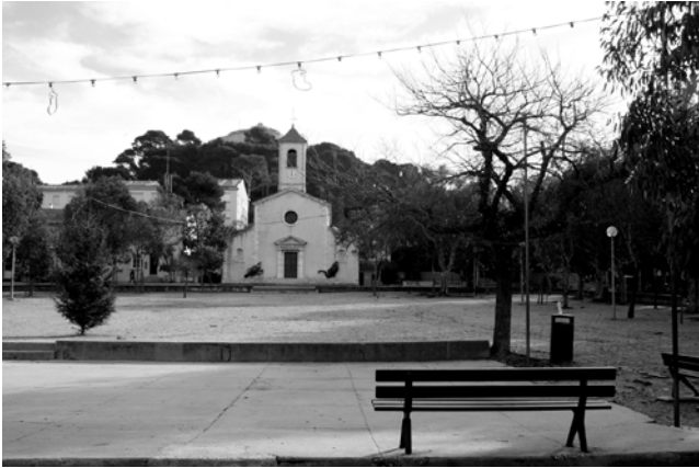
Bench in the square