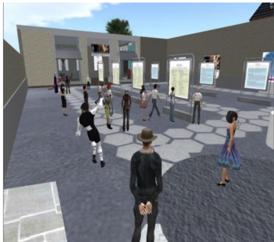
Figure 2. The project information boards in the PREVIEW-PSYCH main area in Second Life<sup>®</sup>.

Participants first went through inductions into SL before moving onto the PREVIEW-Psych project area. The participants worked in small groups using the problem statement (see Appendix 2) to establish whether the virtual child was safe within the existing family environment where multiple psychological and social issues were present (e.g. dementia, anorexia, alcoholism). A written response to the statement was required, using materials provided around the PBL area and within the house itself. Participants worked together to establish the virtual family dynamics, using the information provided within the PBL area, and the impact it had, along with collating basic information about these clinical disorders and the theoretical perspective in psychology which they considered most appropriate as a starting point for treatment.