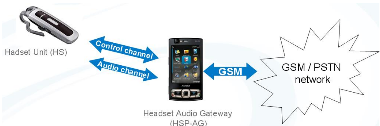
Figure 2: Typical HSP use case

Headset profile supports 8kHz, 8-bit audio.