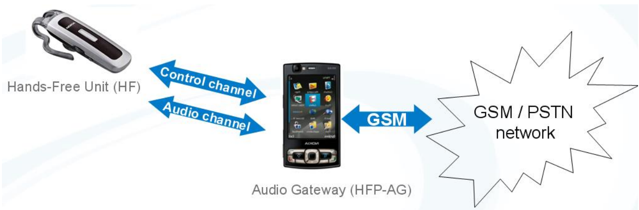
Figure 1: Typical HFP use case

Hands-Free profile v.1.5 and older support 8kHz, 8-bit audio and Hands-Free profile v.1.6 support 16kHz and 8-bit audio also known as Wide Band Speech or HD Voice.