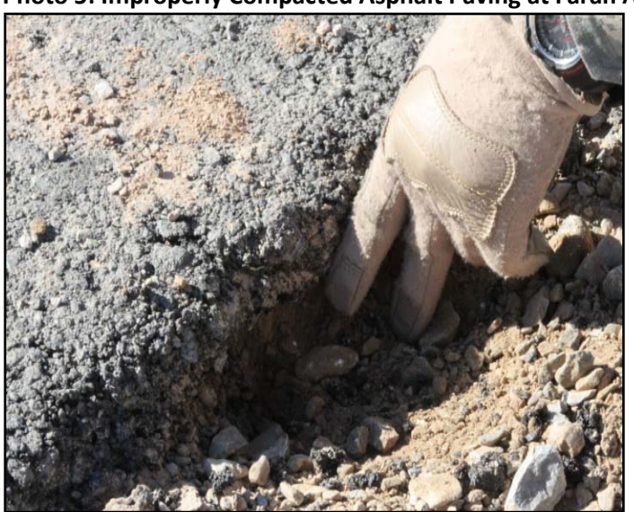
Photo 5: Improperly Compacted Asphalt Paving at Farah ANA Garrison

Further, we observed that the asphalt paving in certain areas on the site seemed to have been compacted improperly. The paving had rough or ragged edges and uneven surfaces (see photo 5). Since our site inspection, AED-South officials stated that additional testing was being performed on the asphalt to verify its thickness and compaction quality. If the asphalt is not compacted correctly, craters could form and the asphalt may deteriorate rapidly. In addition, in our review of quality assurance reports, we found reports that indicated prior problems with the compaction of asphalt roads at the garrison.