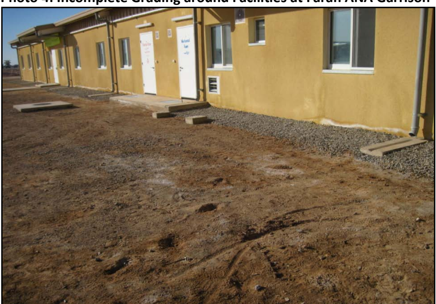
Photo 4: Incomplete Grading around Facilities at Farah ANA Garrison