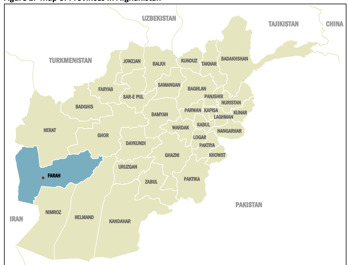
Figure 1: Map of Provinces in Afghanistan