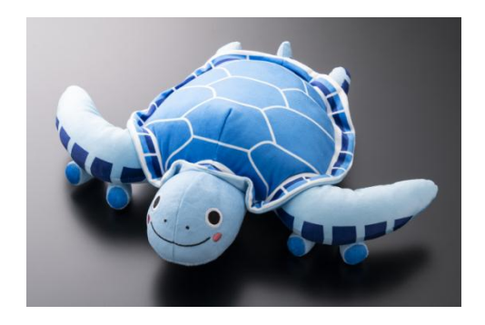
HONU doll (Lani) 1/500 scale: approximately 14.6 x 16.3 x 5 cm