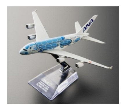
Airbus A380 FLYING HONU Model Plane 1/500 scale: approximately 14.6 x 16.3 x 5 cm

To celebrate this new aircraft, from May 2019, ANA will offer model planes for purchase during international in-flight duty-free shopping. The HONU doll (Lani) will also be available for purchase on the FLYING HONU.