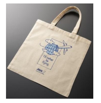
ANA original bag