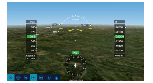
ANA Flight Path 3D

To celebrate this new aircraft, from May 2019, ANA will offer model planes for purchase during international in-flight duty-free shopping. The HONU doll (Lani) will also be available for purchase on the FLYING HONU.