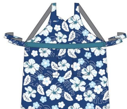
FLYING HONU apron

To ensure that the A380 feels as close to home as possible, ANA took extra consideration and care when selecting bedding for the flight. In First Class, passengers will be able to wrap up in a comforter from Japan's famous Tokyo Nishikawa Sangyo. Travelers can rest their heads on pillows made out of premium Hungarian white duck down. They will also receive a 100 percent organic cotton loungewear and a blanket made by the renowned Japanese producer Tenerita, the only Japanese company that obtained the Global Organic Textile Standard certification.