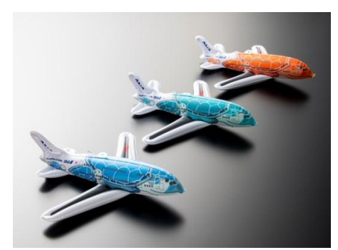
Inflatable FLYING HONU