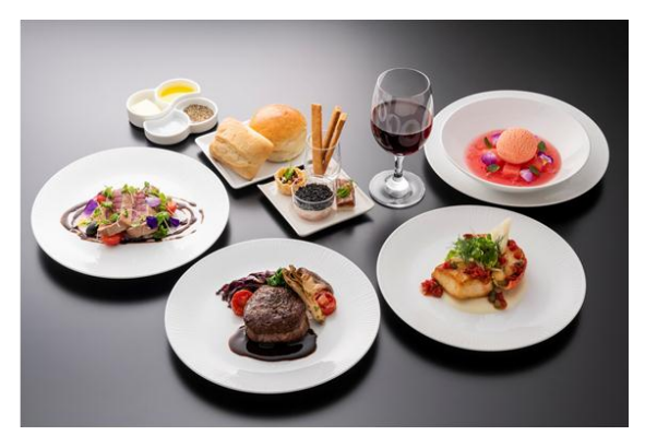
First Class cuisine

ANA will also collaborate with the Australian casual dining "bills" to create a special Economy Class menu for passengers departing from Japan. This collaborative menu is scheduled to run from May 24, 2019, through the end of May 2020. Passengers will receive a special card which they can take to bills Waikiki and exchange for a drink.