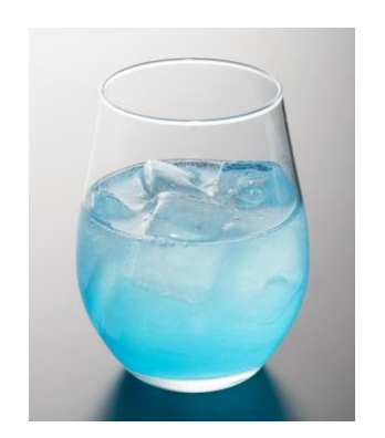
Blue Hawaii Cocktail

All other drinks on board will be served in FLYING HONU themed cups, by flight attendants wearing similarly designed aprons.